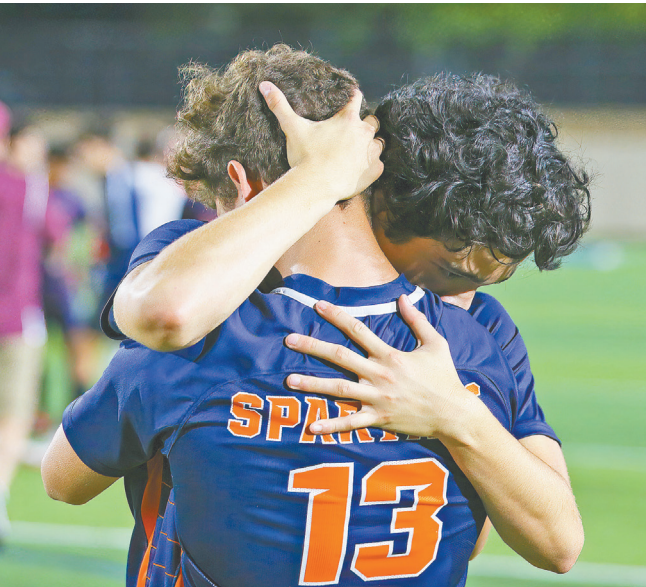
Seven Lakes players take a moment to console one another after a 3-2 loss to Plano in the Class 6A boys state semifinal on April 15, 2022 in Georgetown, Texas.