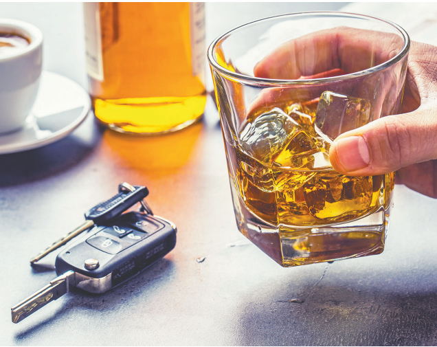
METRO CREATIVE GRAPHICS