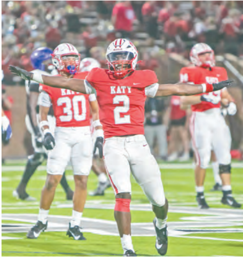
DOMENIC GREY | SPECIAL TO THE KATY TIMES