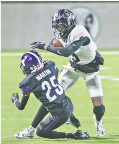
DDOMENIC GREY | SPECIAL TO THE KATY TIMES