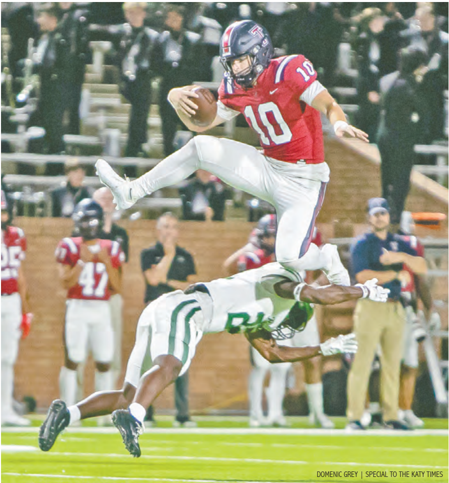
DOMENIC GREY | SPECIAL TO THE KATY TIMES