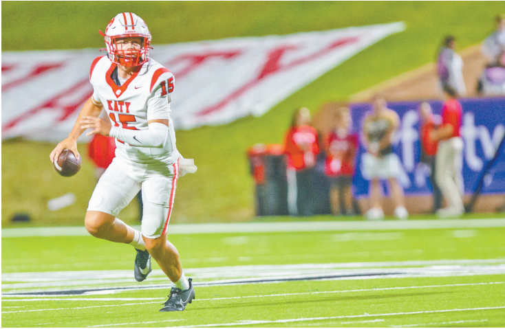
DOMENIC GREY | SPECIAL TO THE KATY TIMES

Advertisement Dates: 10/31/2024 & 11/7/2024