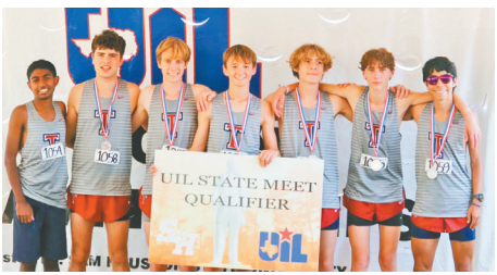
Tompkins boys team poses for a photo after the Region III-6A Cross Country meet.