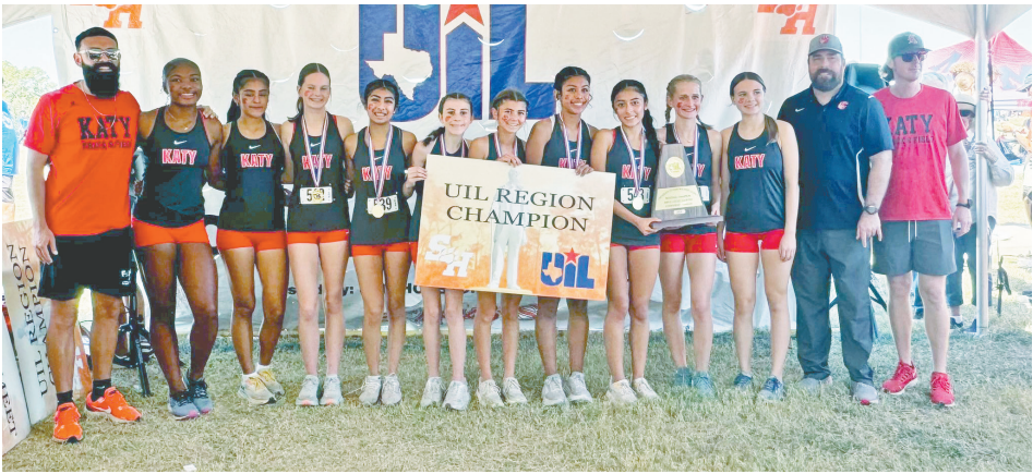
Katy's girls team poses for a photo after the Region III-6A Cross Country meet.