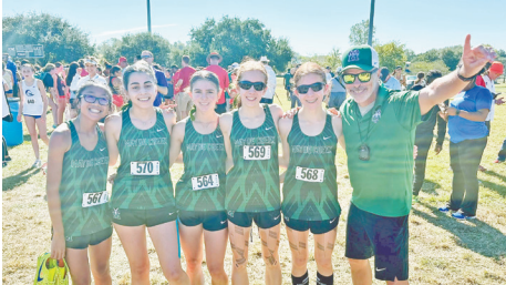
Mayde Creek's girls team poses for a photo after the Region III-6A Cross Country meet.