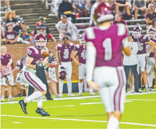
DOMENIC GREY | SPECIAL TO THE KATY TIMES

"Everyone answered the bell tonight," Dudley said. "When we went down it could have gone one of two ways, but everyone fought, and they got us back into it. I'm extremely proud of our defense. They came up so huge in the fourth quarter and did everything we could have asked for. We've had our struggles there, but the defense rose up tonight and they were at their best when we needed them to