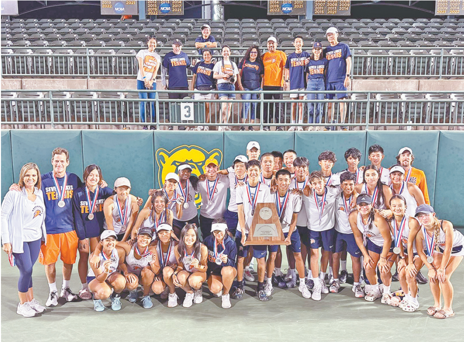
Seven Lakes' tennis team finished second at the Class 6A State Tennis Tournament.