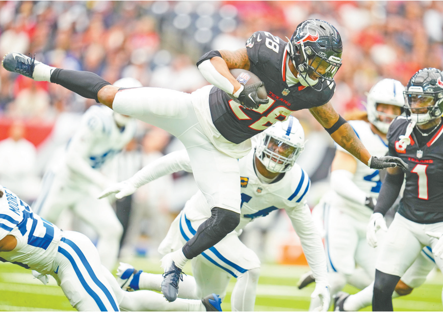
Texans running back Joe Mixon (28) leaps over Colts cornerback Kenny Moore II (23) during the first half of an NFL game on October 27, 2024 in Houston, Texas USA. The Texans won, 23-20.