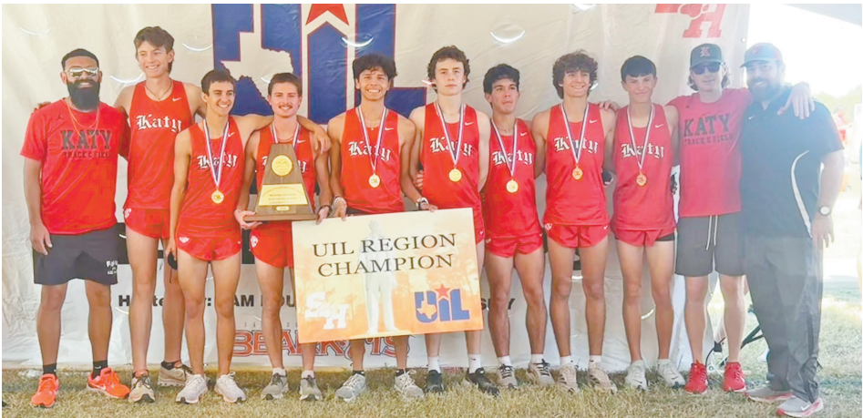
Katy's boys team poses for a photo after the Region III-6A Cross Country meet.