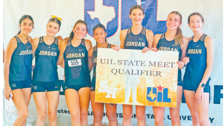
Jordan's girls team poses for a photo after the Region III-6A Cross Country meet.