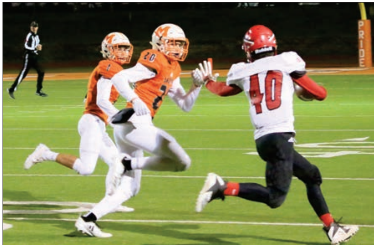
See JACKETS, Page 12