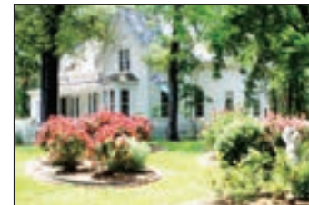
Quitman Arboretum and Botanical Gardens

Winterizing in the gardens involves preparing your plant materials to withstand freezing temperatures as well as a few surprise balmy days. One of our warm weather favorites at the Arboretum is the plumeria. Our plumeria has grown quite