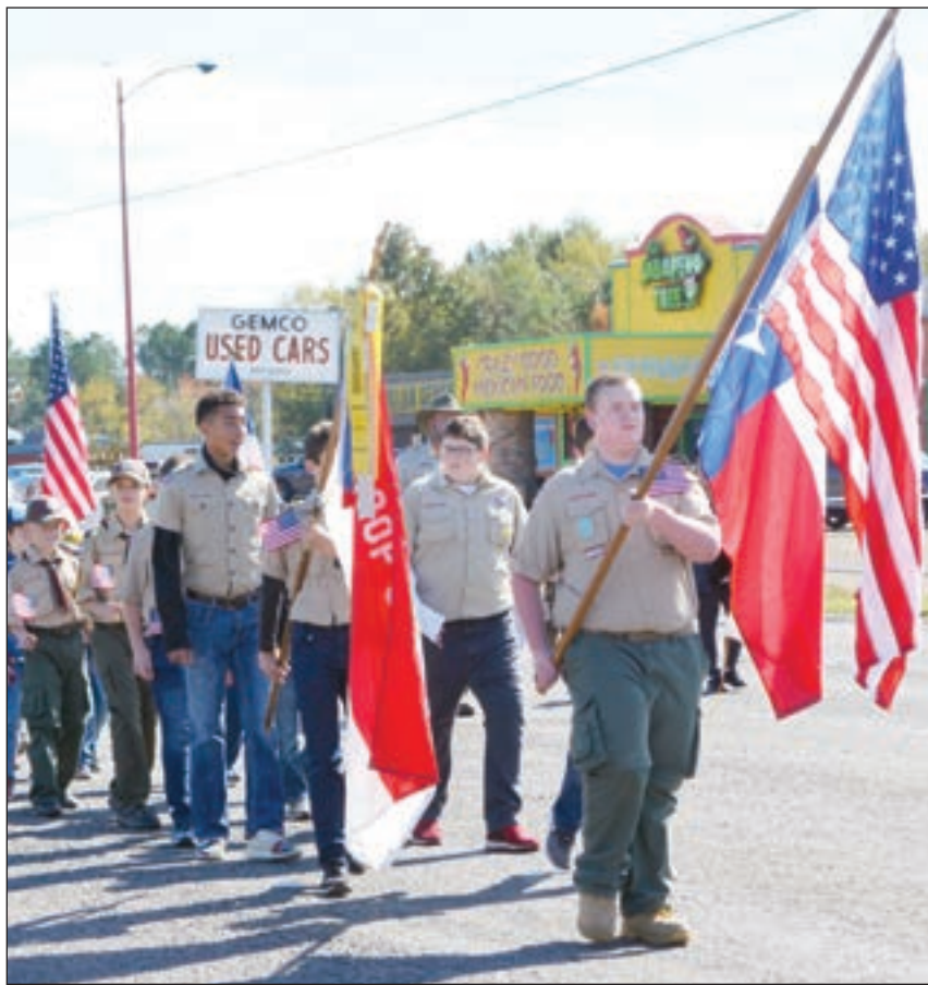
ABOVE: Local Boy Scouts and Cub Scouts march in support of the nation's veterans during Saturday's Veterans Day Parade in Mineola.