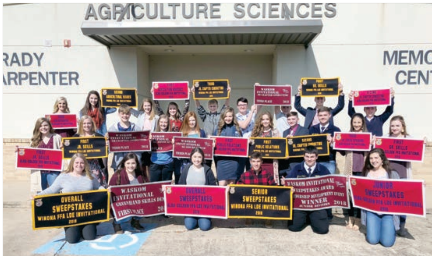
Quitman FFA students stand with the flags they won this semester.