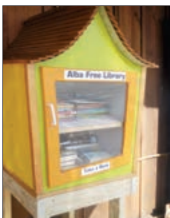
Little Free Library at Golden Grocery and Deli in downtown Golden.

Two of the Little Free Libraries recently commissioned by the council