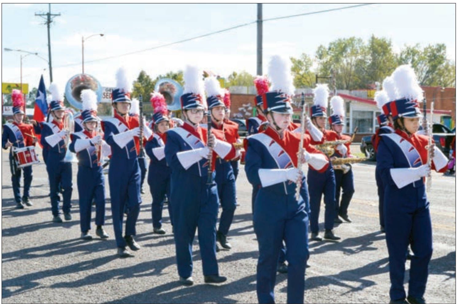
BELOW: The Alba-Golden High School Marching Band honored veterans by taking part in the annual Veterans Day Parade on Saturday in Mineola.