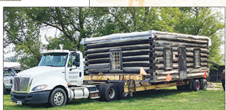
See Page 5 for photos of the restored Bell Knapp Cabin.