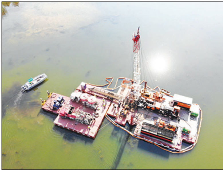
Workers operate a floating rig to plug an orphan oil well in Ottawa County.

“Most plugging projects are similar, involving a mix of wells