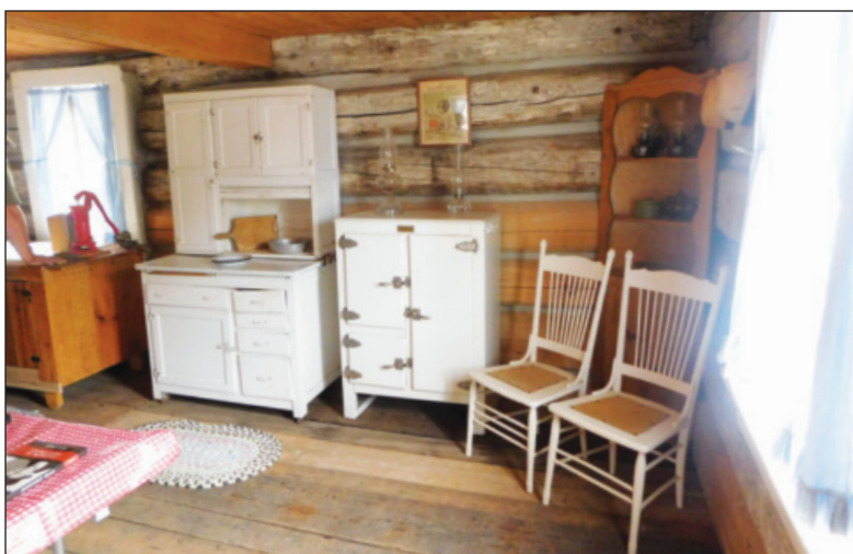
(Cleaver photos by Dianne Alward-Biery)