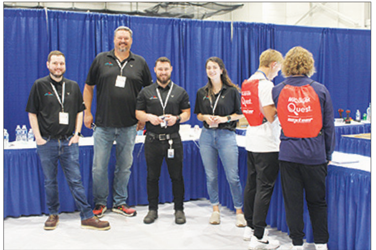
High School sophomores from Clare County will have the chance to interact with more than 70 employers at the 2024 MiCareerQuest Middle Michigan event. Pictured here at last year's event are representatives from Saint-Gobain in Beaverton.

The Clare County Community Foundation exists to cultivate the power of giving within our community, support long-term transformation, and help ensure all residents thrive. Michigan Works! Region 7B is deeply thankful for the foundation's assistance in eliminating this barrier, ensuring Clare County students can participate in this valuable experience.