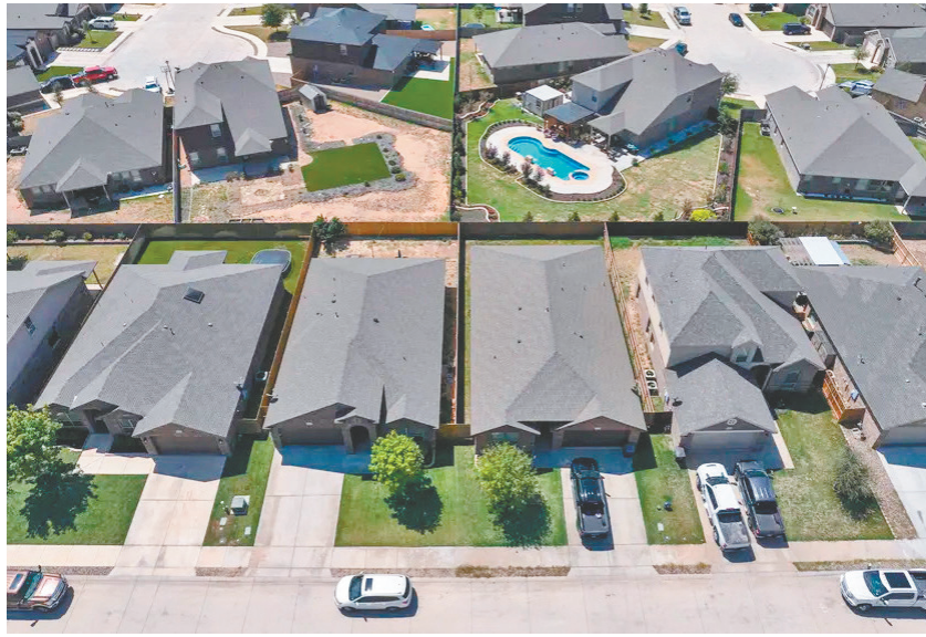
Texas' Republican leadership says they want to cut property taxes. A smaller budget surplus will make that more challenging.