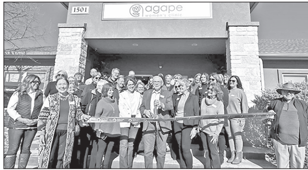
Agape Women's Center • January 23, 2025