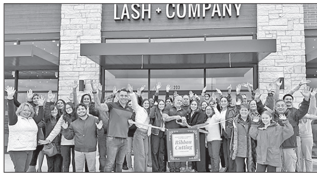
Lash & Co • January 10, 2025