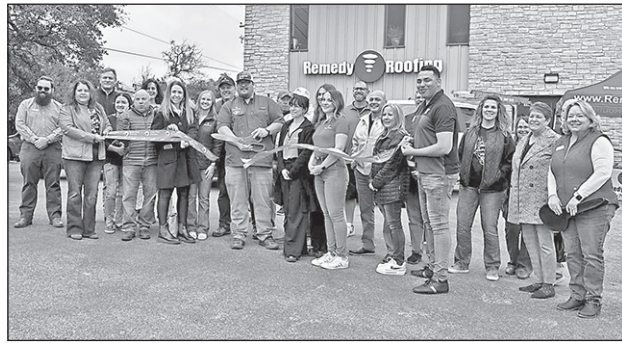
Remedy Roofing • January 17, 2025