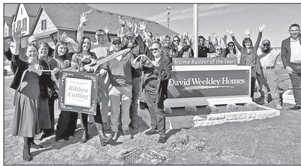
David Weekley Homes • January 15, 2025