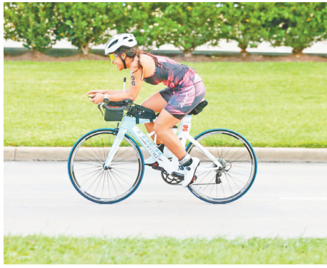
A cyclist competes during the Katy Triathlon on August 31 at The Katy Boardwalk, 24566 Kingsland Blvd. in Katy.