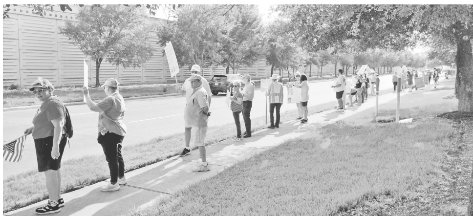
Labor Day protestors display their “Workers Over Billionaires” messages to passers-by traveling the I-10 access road heading west from Westgreen Blvd.