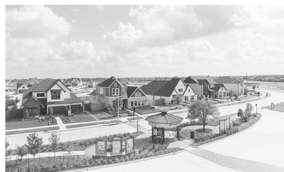
Master-planned community Grange is hosting a free community event on September 20 where families may sip, snack and shop the new development west of Katy while enjoying kid-friendly activities.

Information about the new 1,130-acre Grange community by Johnson Development is available at www.livein-grange.com .