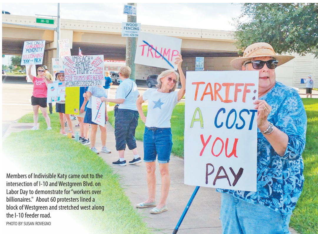
Members of Indivisible Katy came out to the intersection of I-10 and Westgreen Blvd. on Labor Day to demonstrate for "workers over billionaires." About 60 protesters lined a block of Westgreen and stretched west along the I-10 feeder road.