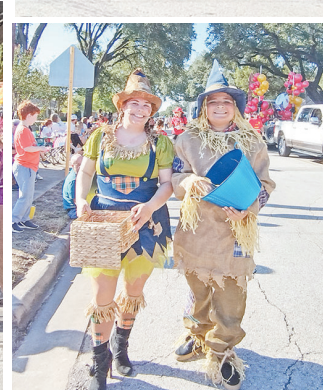
On a perfect autumn day on October 4, the Katy Rice Harvest Festival Parade wound through the heart of Old Katy, from East Avenue to Second Street around the historic downtown square to Avenue C and North. There were over forty entries, including politicians, school groups, service organizations and youth organizations. The event is sponsored by the City of Katy in partnership with the Rotary Club of Katy. The Katy Rice Harvest Festival is October 11-12 in Katy's downtown square at Second Street and Avenue C.