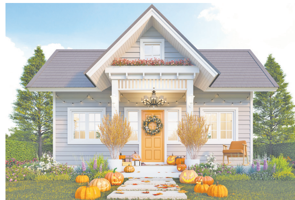
METRO CREATIVE GRAPHICS