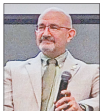
JON ROSENTHAL Texas District 135 Representative