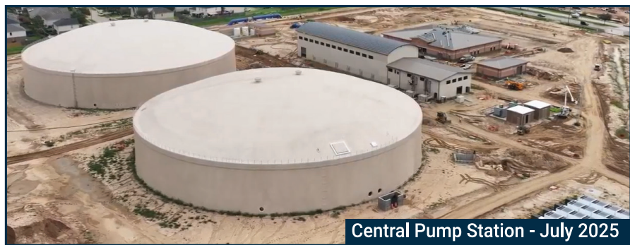
Central Pump Station - July 2025

WHCRWA is building more than pipelines—we're building a future that ensures reliable, sustainable water for generations to come. From major infrastructure projects like the Surface Water Supply Project to local connections and distribution lines, each milestone supports our region's shift away from groundwater to protect against subsidence and meet long-term water needs.