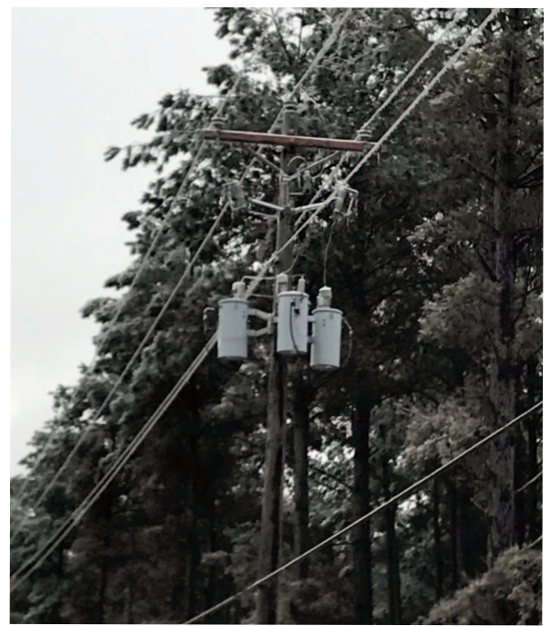
EMEPA crews work to restore power throughout parts of Kemper County following the winter storm that barreled through Mississippi last week, causing a number of outages.