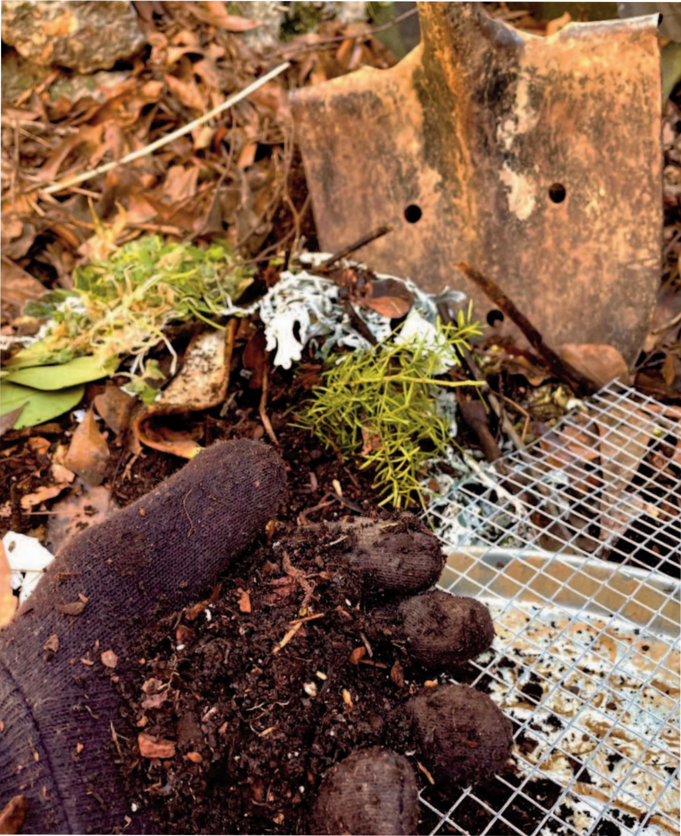
Screened compost from leaf pile