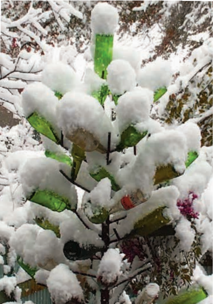
Bottle tree for winter color