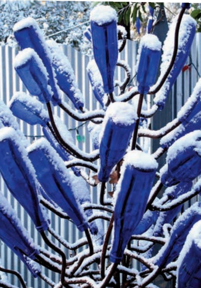
Bottle tree for winter color