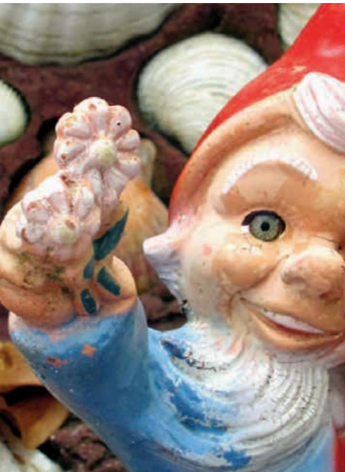
Cheer up the garden before winter

all. Absolutely nothing wrong with over accessorizing, of course; a sense of the absurd is expressed by lots of folks who simply take their knick-knack shelf sensibility to the garden. N It doesn't have to be "twee" - excessively cute or quaint. Think "too many gnomes and a little girl figurine with an umbrella" plus a spinning windmill, rocks and seashells from every vacation, a "dirty gardener lives here" placard, and [insert your school or politics here] flag." Think birdbath, oversized urn, large stone, driftwood, reflective gazing globe, colorful wall hanging on the fence, St. Fiacre (patron saint of gardeners) statue. A group of matching or complementary containers with winter annuals and small landscape shrubs or trees that can be set out in the yard in the spring. In a word, anything. Anything that, when the summer stuff crashes, will catch the eye and thwarts your grief until the new stuff fills in. My go-to for staving off Seasonal Affective Disorder is colorful glass, both professionally done by glass artists and home-made bottle trees. All year they gather light past dusk, but in the fall and winter they glint in the sun and bring much-needed color to the winter garden. There's nothing quite like