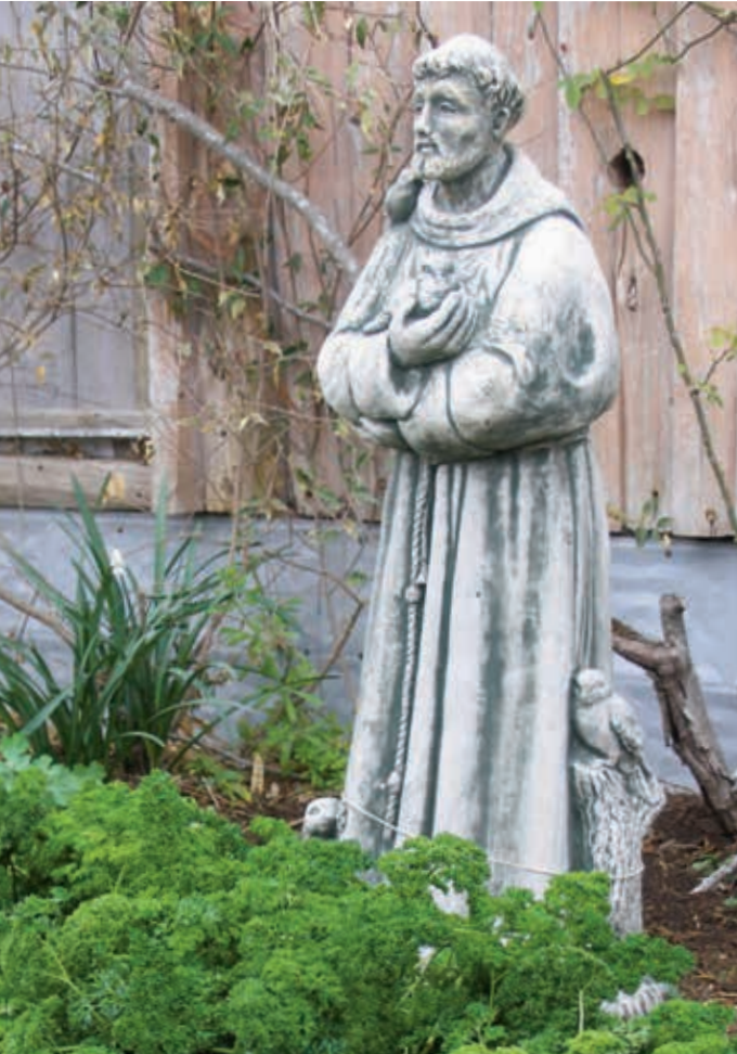
Statue carries the garden through seasons