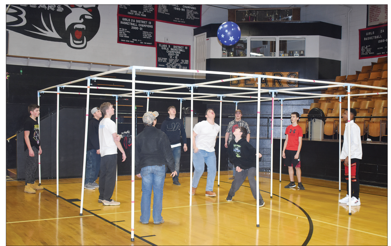
Students play a game during the Fifth Quarter after Homecoming celebration. The school opted to play games instead of having a traditional dance.

Instead of the traditional dance the committee came up with a game night. Of course they still had music playing all night, but instead of that being the sole purpose it was just an added bonus. The students who chose to stay after the Homecoming game played nine square, corn hole, and giant Jenga. They then participated in a mass dance party to the popular "Wobble Baby," "Cha Cha Slide" and