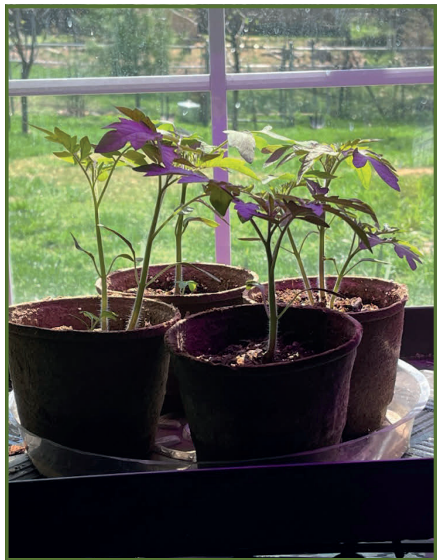
Tomatoes are just one type of crop that can be found in a home garden.