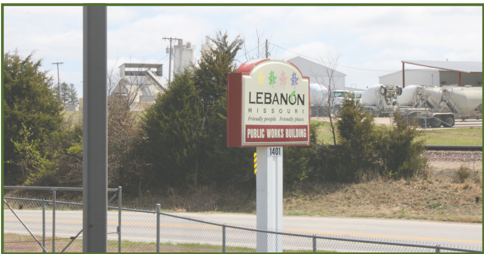
Lebanon public works building sign.

clade County. A valid ID or utility bill may be required as proof of residency. Please drop off materials at the designated areas and remove any bags. Accepted materials include: Leaves, tree limbs, grass clippings, shrub trimmings No treated lumber or stumps Laclede County residents only: Pickup trucks and small trailers from residential properties can use this service free of charge. Anyone with questions about city services, may call (417) 532-2156 or contact "Ask Truman," Lebanon's virtual assistant. Text "Hello" to 844-771-4636: Start a conversation with Truman by sending a text message. Just text the word "Hello" to 844-771-INFO (844-771-4636) or visit the city website: Go to lebanonmissouri.org and click on the Truman icon. Truman will pop up to help you navigate the site and answer your questions.