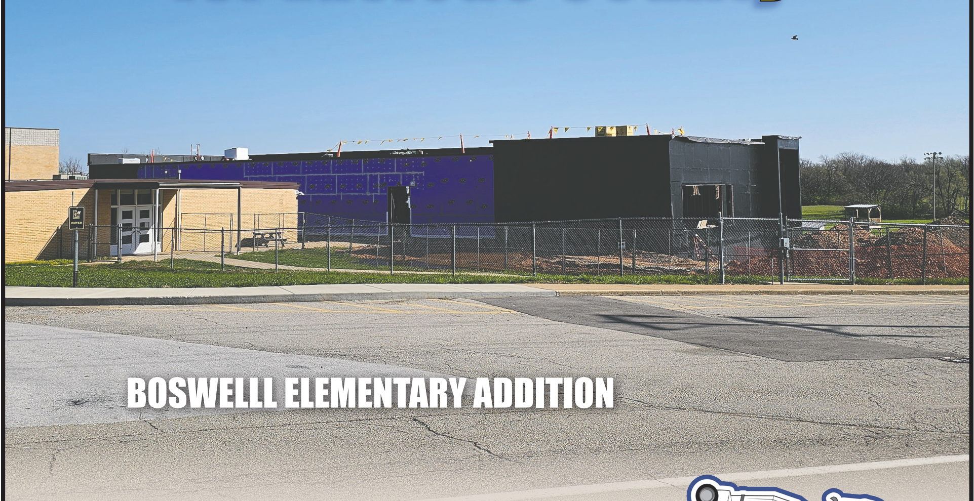
BOSWELL ELEMENTARY ADDITION