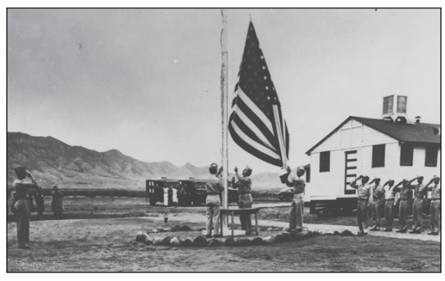
First Flag Raising on July 9, 1945

Simultaneously, defensive weapon systems began testing at White Sands. Most of the missiles developed at the range were never used in conflict but they gave our country the technological edge needed in the long Cold War. The Nike Ajax and Nike Hercules antiaircraft missiles were tested and perfected at White Sands in the 1950s and 60s. They were then deployed to protect cities and bases all over Amer-