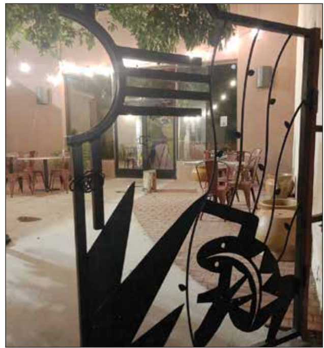
Patio of Little Toad Creek Brewery & Distillery