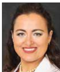
COVID-19 Physician Response Team MountainView Regional Medical Center