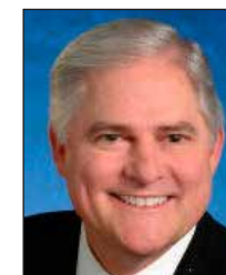
John Harris Memorial Medical Center