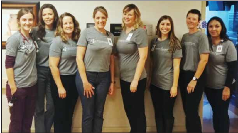
Advanced Care Hospital of Southern New Mexico Vent Team Advanced Care Hospital of Southern New Mexico