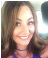
Cynthia Woods MountainView Regional Medical Center