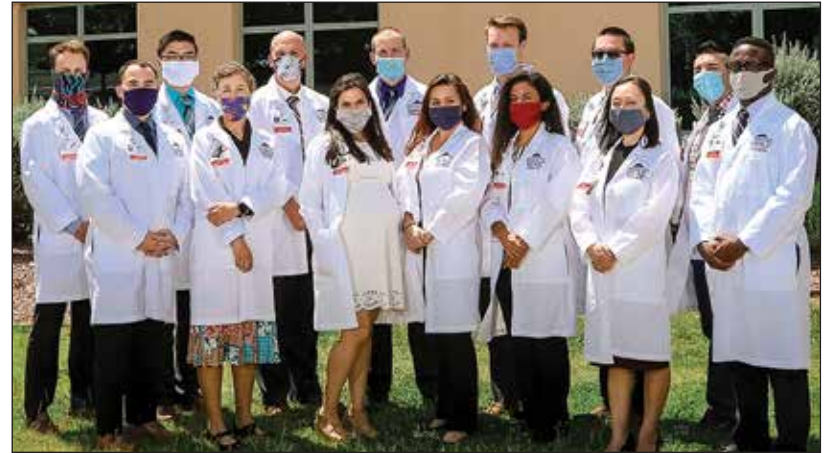
MountainView GME Department/Residency Programs MountainView Regional Medical Center