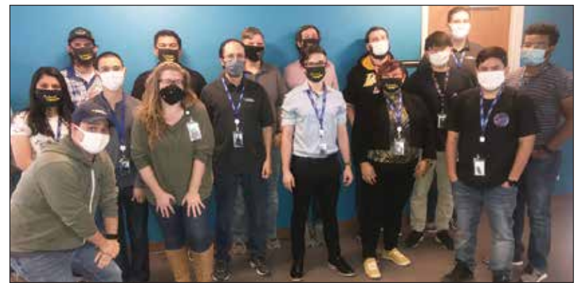
Electronic Caregiver D3-Innovation Electronic Caregiver