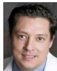
John Andazola Memorial Medical Center