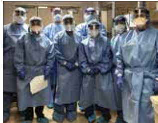
Intensive Care Unit MountainView Regional Medical Center