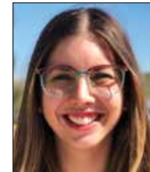
Taylor Garrison Advanced Care Hospital of Southern New Mexico