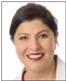
Dr. Dolores Gomez Memorial Medical Center