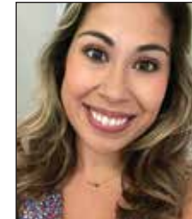
Leah Ponce Rehabilitation Hospital of Southern New Mexico