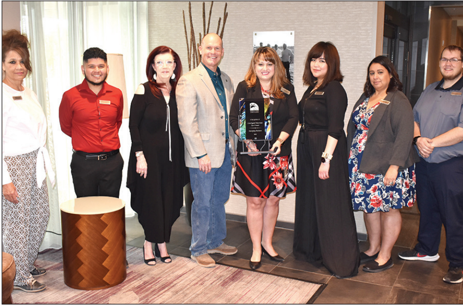
Emerging Business, Courtyard by Marriott.