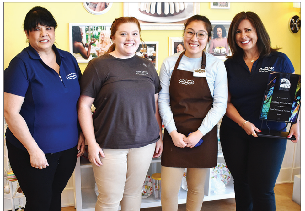
Small Business of the Year, Nothing Bundt Cakes.