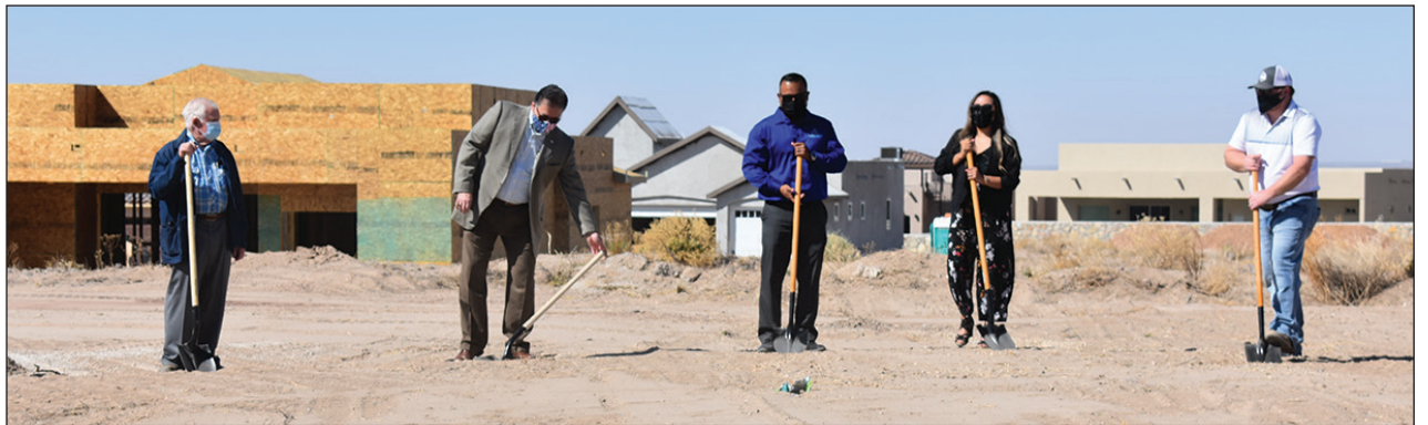
The Chamber was honored to participate with Las Cruces Homebuilders Association in the groundbreaking for 2021 5th Casa for a Cause.

The previous four houses have raised funds ranging from $64,000 to $125,000, and supported dozens of nonprofit