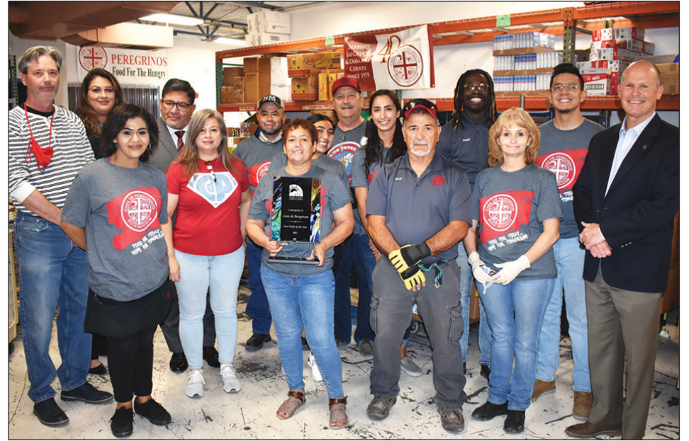
Non Profit of the Year, Casa de Peregrinos.