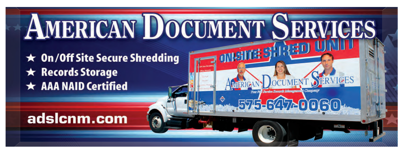
Meet Your Las Cruces Professionals Spring 2015 • 3

The profiles included in Meet Your Las Cruces Professionals are paid advertisements.