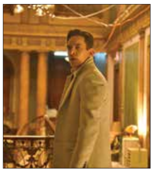
Jonathan Rhys Meyers