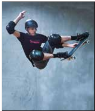
"Tony Hawk: Until the Wheels Fall Off"