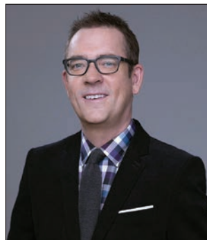
Ted Allen hosts "Chopped" Tuesday on Food Network.