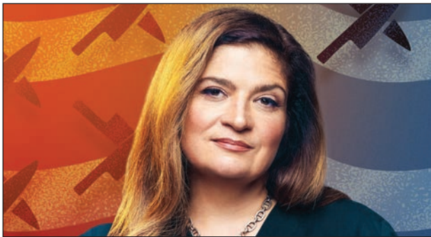
Alex Guarnaschelli is featured on "Alex vs. America" Sunday on Food Network.

NASCAR Cup Series Goodyear 400 FS1 1 p.m.