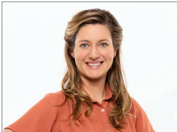
Zoe Perry stars in "Young Sheldon" Thursday on CBS.