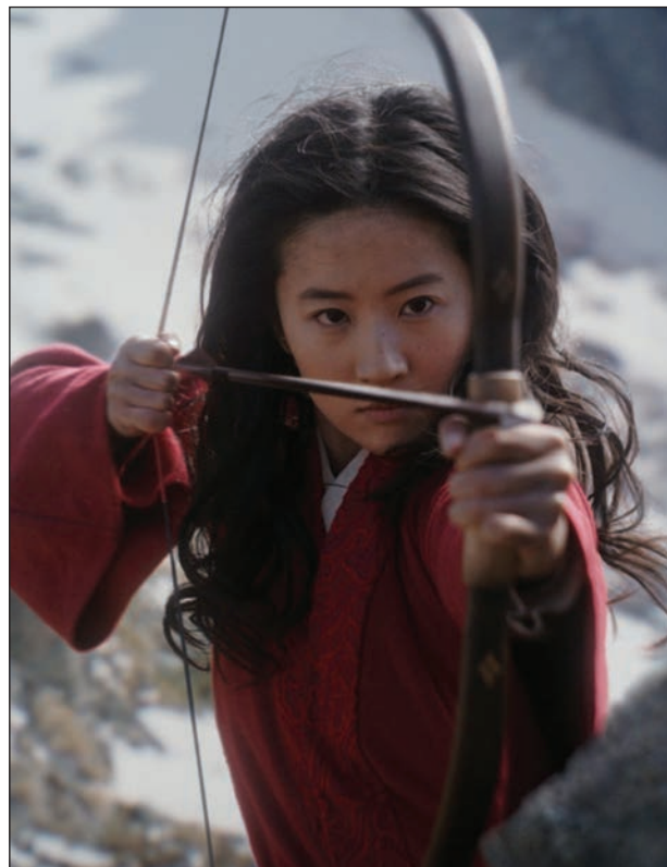
Liu Yifei stars in "Mulan" Saturday on FX.