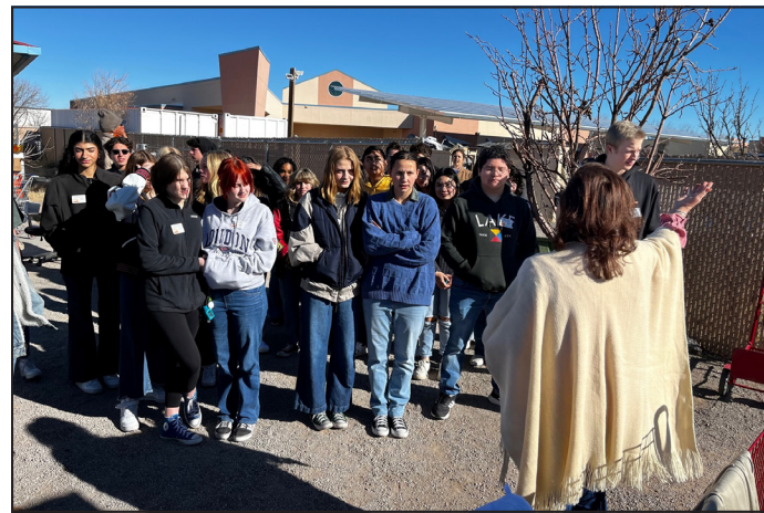
Junior Leadership students visit Community of Hope in Las Cruces.