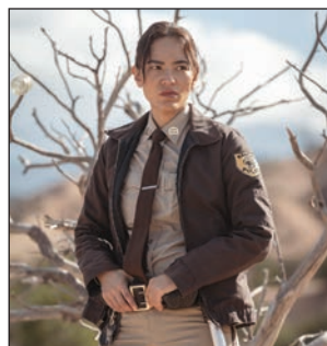
Jessica Matten in "Dark Winds"