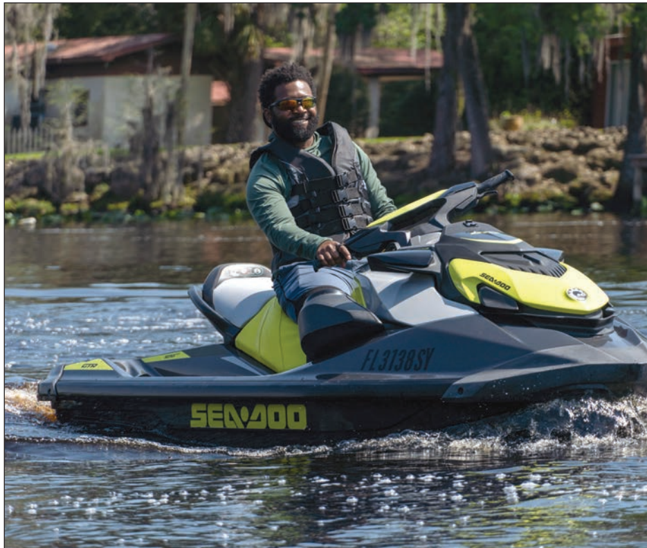
Baratunde Thurston from "America Outdoors with Baratunde Thurston"