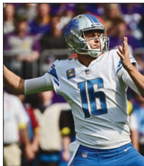
Quarterback Jared Goff of the Detroit Lions