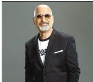
Howie Mandel from "America's Got Talent"