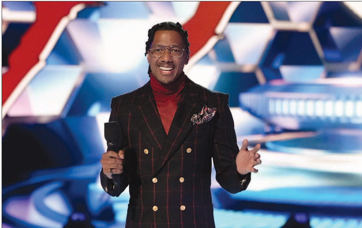
Nick Cannon from "The Masked Singer"