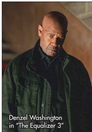
Denzel Washington in "The Equalizer 3"

AS Adult situations N Nudity P Profanity GV Graphic Violence V Violence