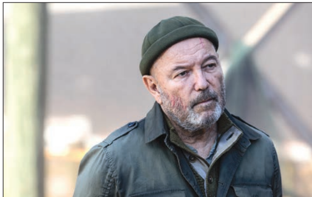
Rubén Blades in "Fear the Walking Dead"