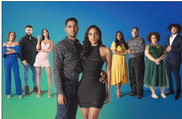
The cast of "The Family Chantel"