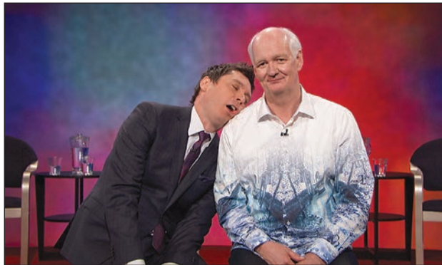
Jeff Davis and Colin Mochrie in "Whose Line Is It Anyway?"