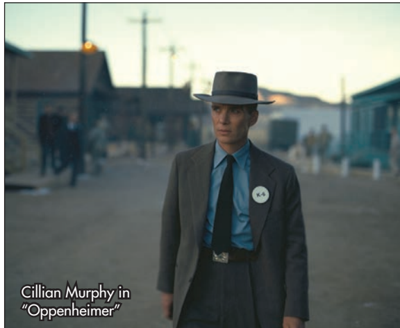
Cillian Murphy in "Oppenheimer"

AS Adult situations N Nudity P Profanity GV Graphic Violence V Violence