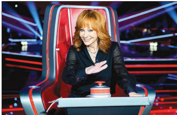
Reba McEntire from "The Voice"