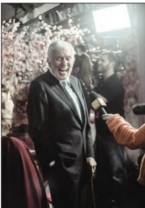
Dick Van Dyke honored in "Dick Van Dyke 98 Years of Magic"