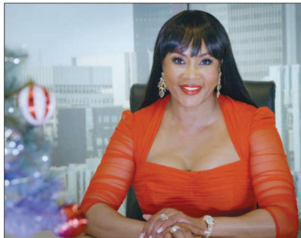
Vivica A. Fox in "A Christmas Intern"