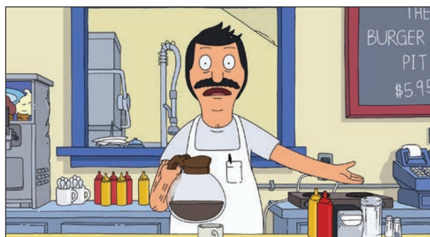
Bob Belcher in "Bob's Burgers"