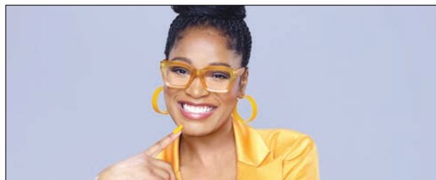
Keke Palmer hosts "Password"