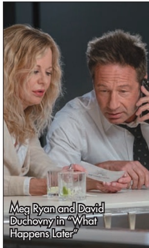
Meg Ryan and David Duchovny in "What Happens Later"

AS Adult situations P Profanity V Violence N Nudity GV Graphic Violence