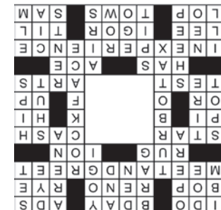
Mr. October Solution:

Crusades to find Maid Marian. (2:00) TCM Sat. 8 p.m.