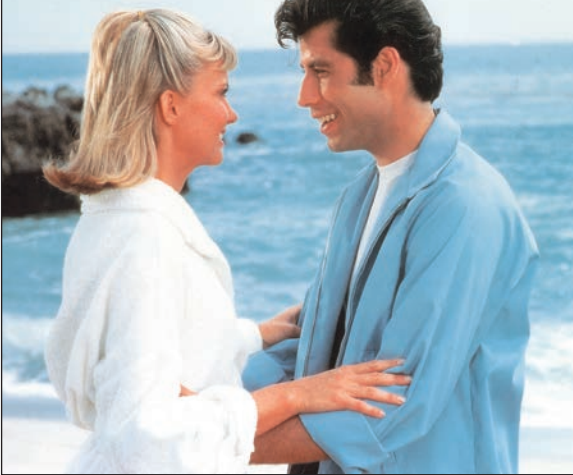
Olivia Newton-John and John Travolta in "Grease"

AS Adult situations N Nudity P Profanity GV Graphic Violence V Violence