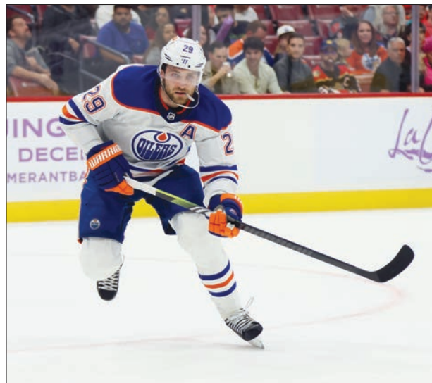
Leon Draisaitl of the Edmonton Oilers