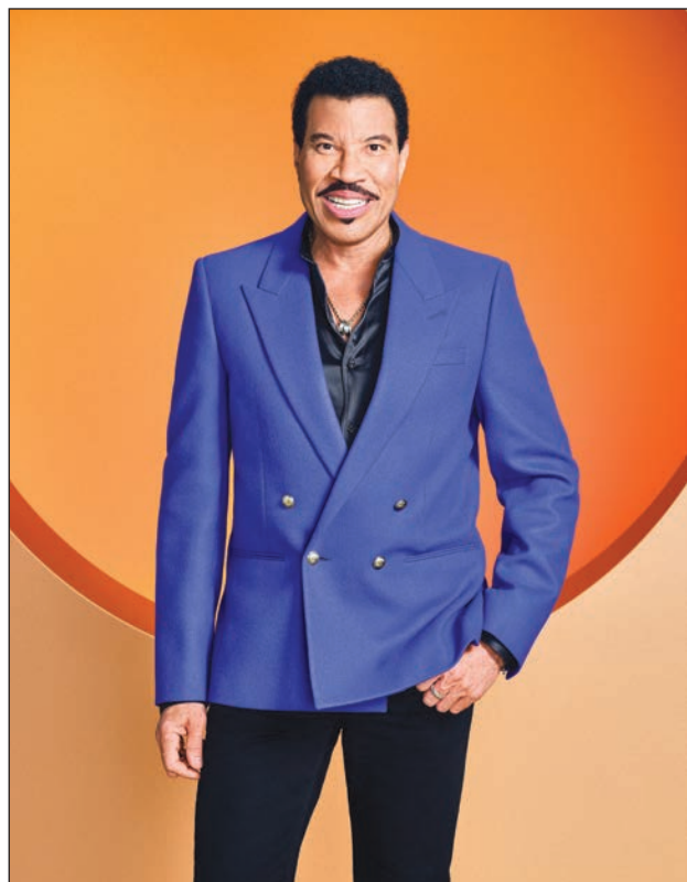
Lionel Richie returns as a judge for "American Idol"