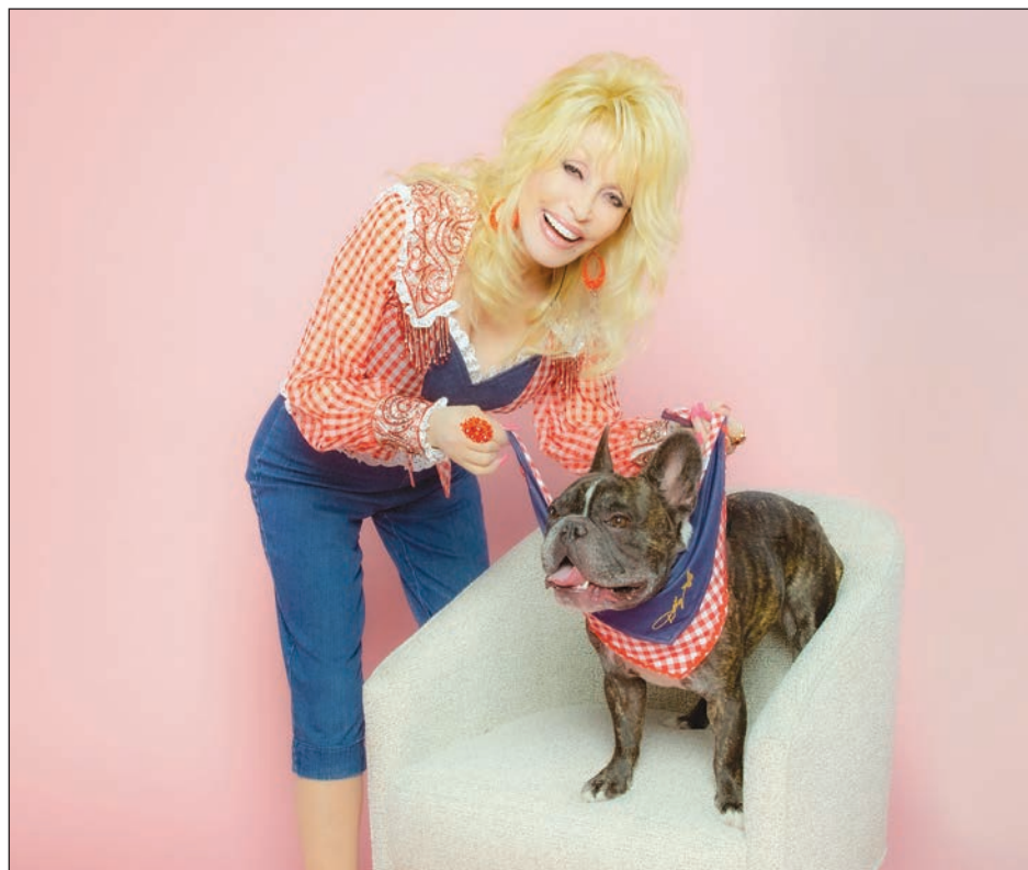
Dolly Parton co-hosts "Dolly Parton's Pet Gala"