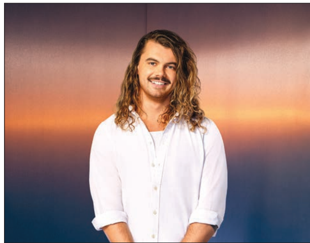
Oisín O'Neil stars in "Southern Hospitality"