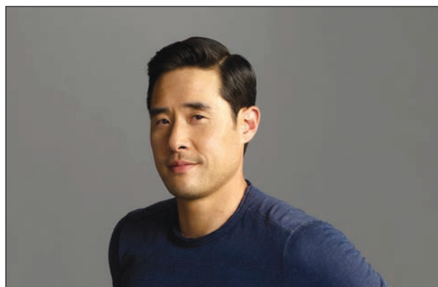
Raymond Lee stars in "Quantum Leap"