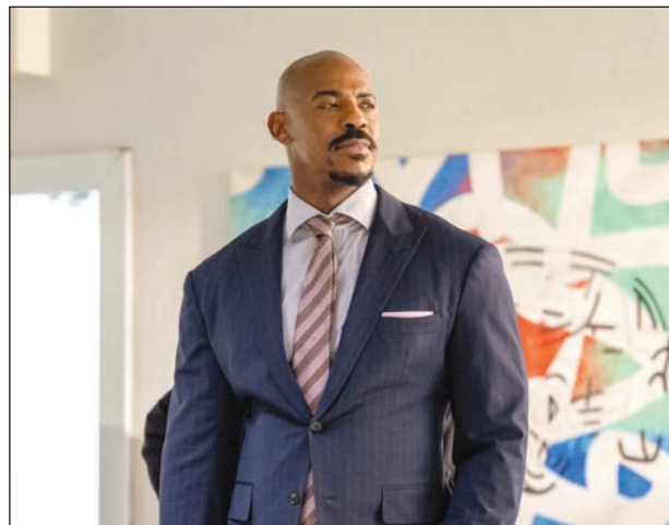
Mehcad Brooks in "Law & Order"