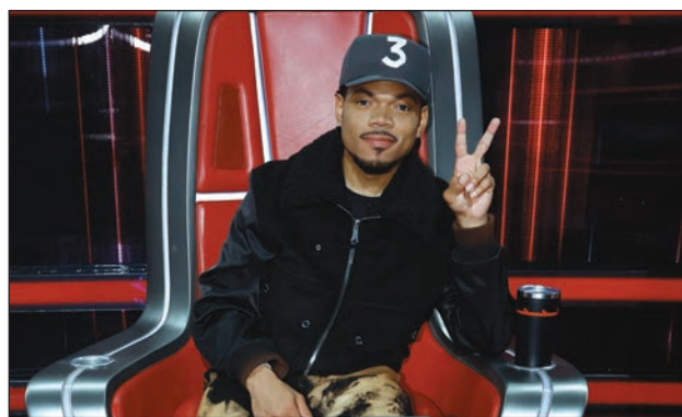
Chance The Rapper returns for Season 25 of "The Voice"