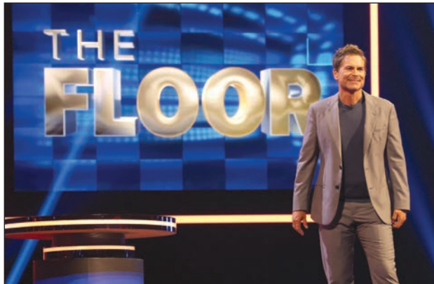
Rob Lowe hosts "The Floor"