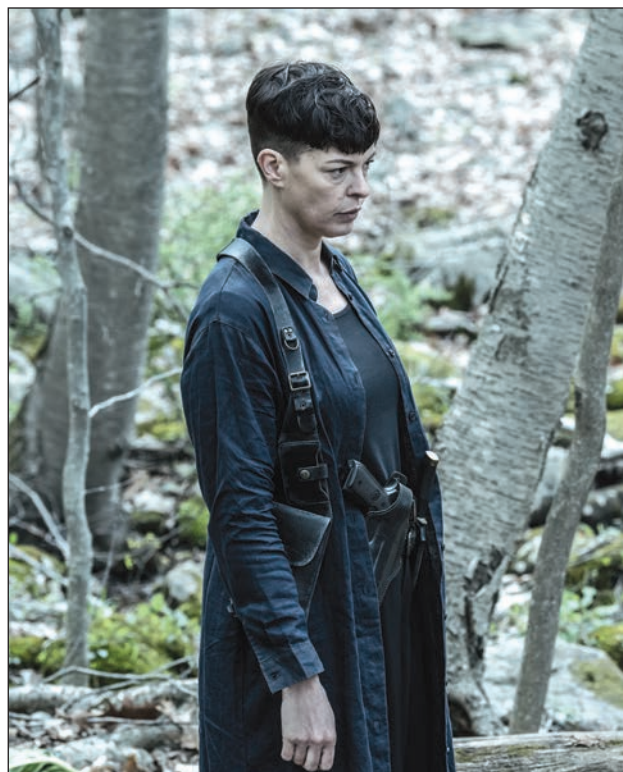
Pollyanna McIntosh in "The Walking Dead: The Ones Who Live"