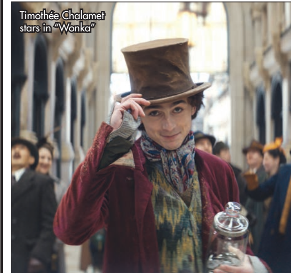
Timothée Chalamet stars in "Wonka"

AS Adult situations N Nudity P Profanity GV Graphic Violence V Violence