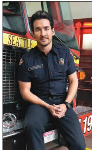
Jay Hayden in "Station 19"