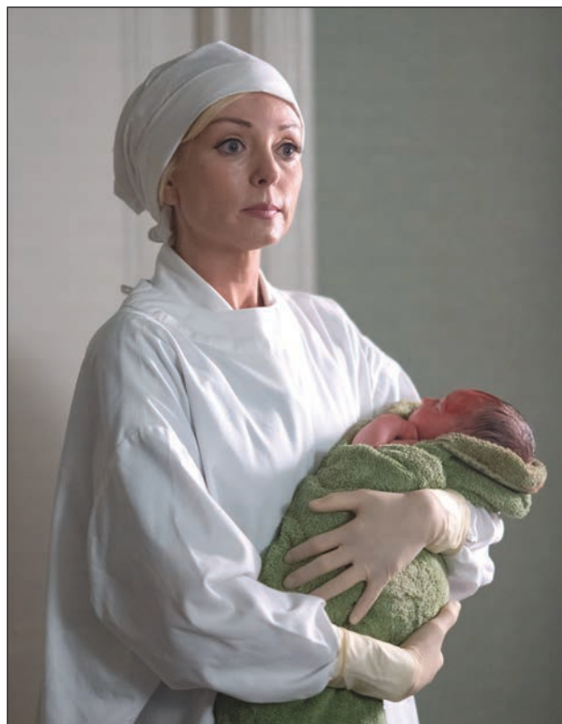
Helen George in "Call the Midwife"