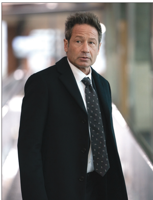
David Duchovny in "What Happens Later"