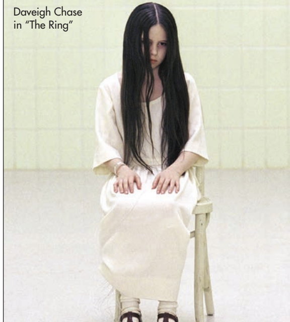
Daveigh Chase in "The Ring"

AS Adult situations P Profanity V Violence N Nudity GV Graphic Violence