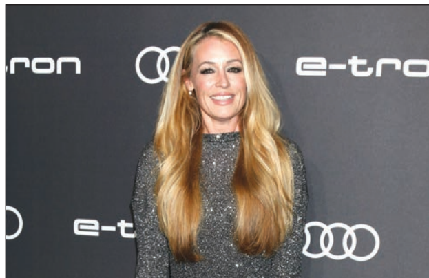
Cat Deeley hosts "So You Think You Can Dance"