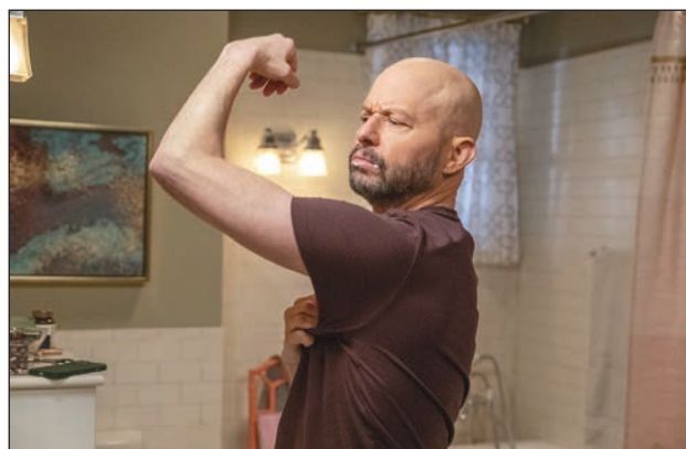
Jon Cryer in "Extended Family"