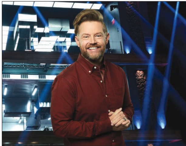
Richard Blais is a mentor in "Next Level Chef"

Sex and the City AIDAN COURTNEY JARED MARIA NYC ALEXSAN-DR DATING KIRA MARK OLIVER BARBARA ENID LANEY MARYANN PATTY BITSY FASHION LAVIGNE MICK PAUL BRUNCH FERNANDA LESLIE MILOS SAMANTHA BUNNY HARRY LOVE MR. BIG SMITH CARRIE HBO LYNN NATASHA STANFORD CHAR-LOTTE HEIDI MANHAT-TAN NICOLE STEVE JACK TAN NINA TREY JAMIE MARGO NOAH WEEZIE