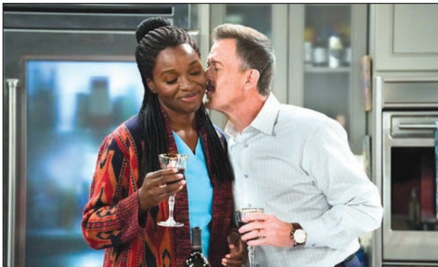
Folake Olowofoyeku and Billy Gardell as seen in "Bob Hearts Abishola"