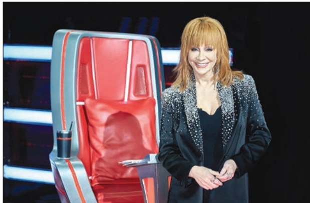
Reba McEntire serves as a coach in "The Voice"