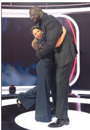
Gina Rodriguez and Shaquille O'Neal host "Lucky 13"