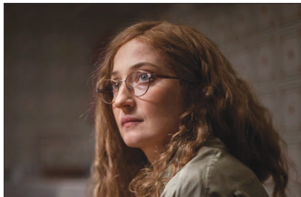
Alba Rohrwacher in "My Brilliant Friend"