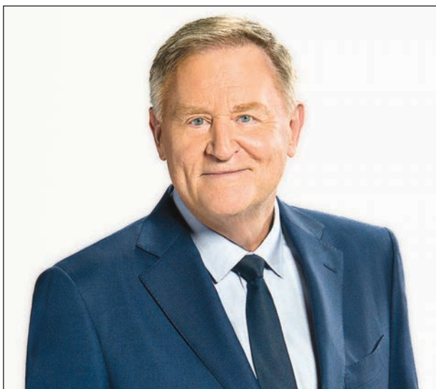
Peter Van Sant is a correspondent in "48 Hours"

505 S. Main, Suite 250, Las Cruces NM • www.lascrucesbulletin.com