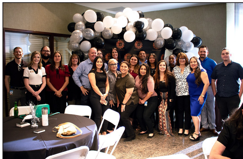
Thank you Pioneer Bank, Lohman Branch, for hosting our September Business After Hours