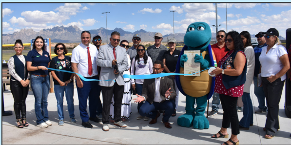
The City of Las Cruces held a ribbon cutting on Friday, September 13, to celebrate the completion of the East Mesa Recreation Complex, 4582 Sonoma Springs Rd. Ziggy the Turtle held the proclamation while Mayor Eric Enriquez cut the ribbon.