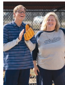
“Somebody Somewhere” - Season 3 (Max — Oct. 27, Season Premiere)

Sam (Bridget Everett) is a true Kansan on the surface, but, beneath it all, she struggles to fit the hometown mold. Grappling with loss and acceptance, singing is Sam's saving grace and leads her on a journey to discover herself and a community of outsiders who don't fit in but don't give up, showing that finding your people, and finding your voice, is possible. Anywhere. Somewhere. In Season three, we see growth against all odds. Jeff Hiller, Mary Catherine Garrison, Tim Bagley and Murray Hill also star.