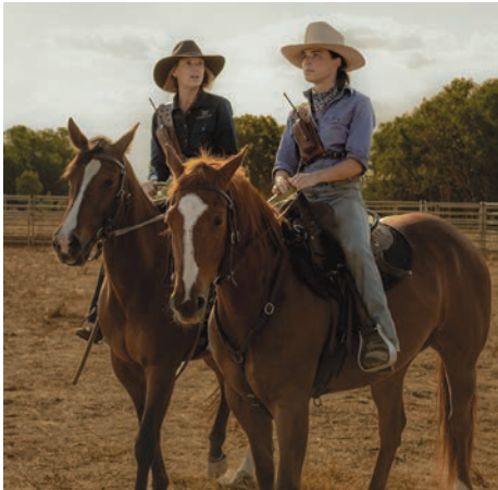
“Territory” - Season 1 (Oct. 24)

When the world's largest cattle station is left without a clear successor, generational clashes threaten to tear the Lawson family apart. Sensing this once great dynasty is in decline, the outback's most powerful factions — including rival cattle barons, desert gangsters, Indigenous elders and billionaire miners — move in to claim it for their own.