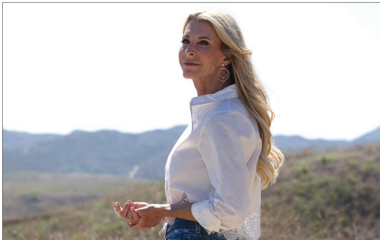
Joan Vassos stars in "The Golden Bachelorette"