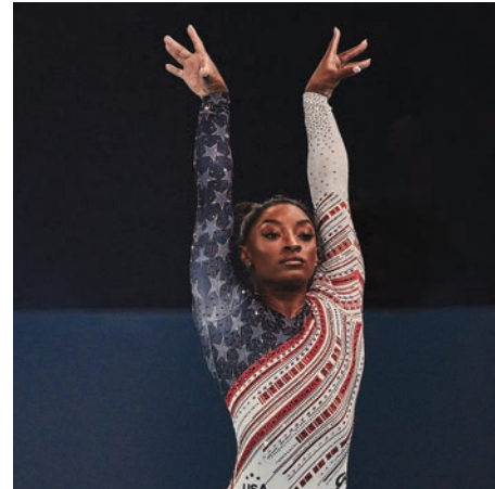
“Simone Biles Rising: Part 2” (Oct. 25)