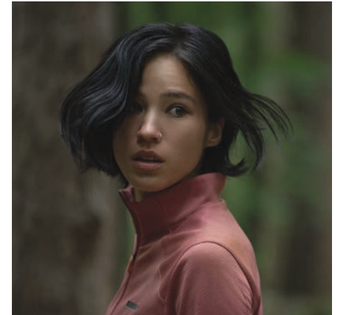
“Don't Move” (Oct. 25)

Get an inside look at the hard work and dedication that led to celebrated Olympian Simone Biles' triumphant comeback when Part 2 of this docuseries. Biles shocked the world by withdrawing from the 2020 Olympic Games in Tokyo, despite being the clear frontrunner. While the withdrawal was best for Biles' struggling mental health, it led to a massive online backlash. Four years — and a much-needed hiatus — later, Biles returned to world athletics' biggest stage for the Paris 2024 Olympic Games, with hopes of reclaiming her throne.