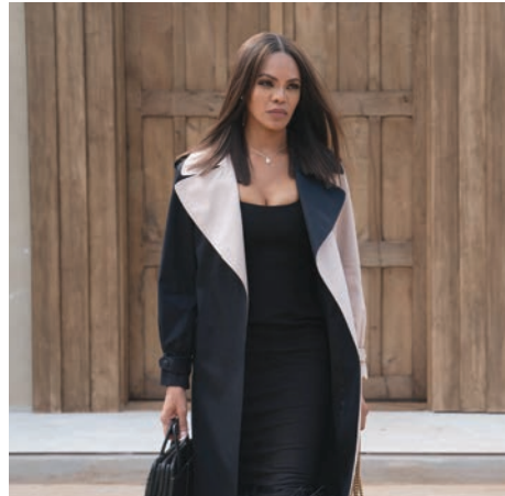
“Beauty in Black” - Season 1 (Oct. 24)

When the world's largest cattle station is left without a clear successor, generational clashes threaten to tear the Lawson family apart. Sensing this once great dynasty is in decline, the outback's most powerful factions — including rival cattle barons, desert gangsters, Indigenous elders and billionaire miners — move in to claim it for their own.