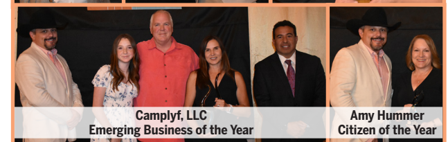
Camplyf, LLC Emerging Business of the Year