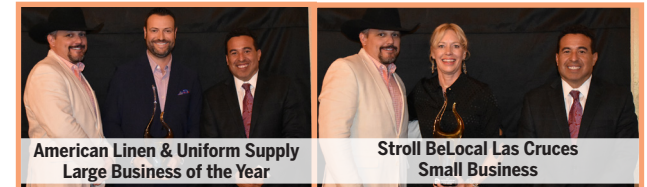
American Linen & Uniform Supply Large Business of the Year

On Friday, October 4, the Chamber hosted a celebration of business & presented several awards at the Chamber's Annual Celebration & Awards Ceremony.