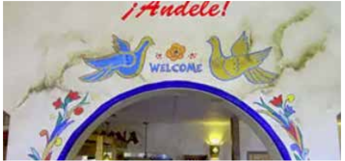
1950 Calle del Norte • 1983 Calle del Norte • Mesilla