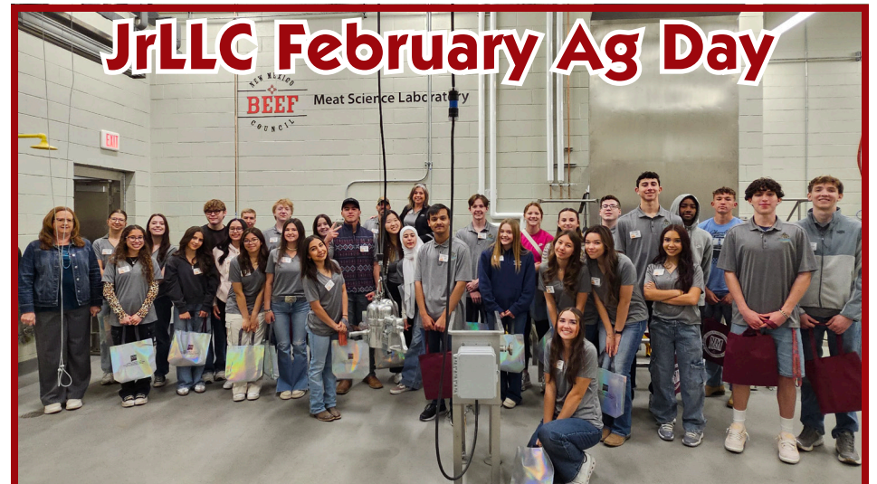
The 2024/2025 Jr Leadership February class toured the various departments at NMSU for their AG Day.