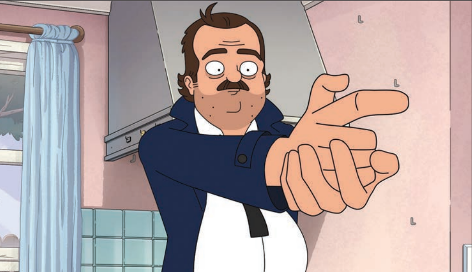
Marvin Flute in "Grimsburg"