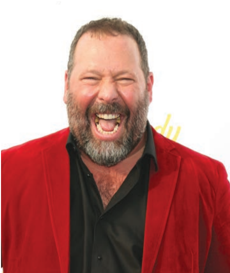
“Bert Kreischer: Lucky” (March 18) Losing 45 pounds, getting parenting advice from Snoop Dogg... Bert Kreischer knows he's the luckiest guy around, and he's recounting his blessings in this latest stand-up special.