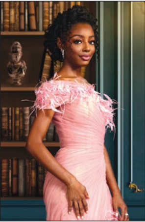
Venita Aspen stars in "Southern Charm"