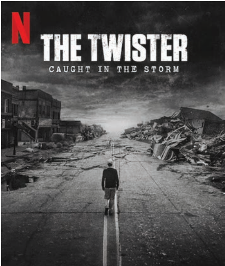
“Twister: Caught in the Storm” (March 19) In May 2011, the town of Joplin, Missouri, was hit by a rare EF-5 monster tornado. As local high school seniors collect their diplomas at graduation and look towards their futures, it soon seems like the world could be ending instead.