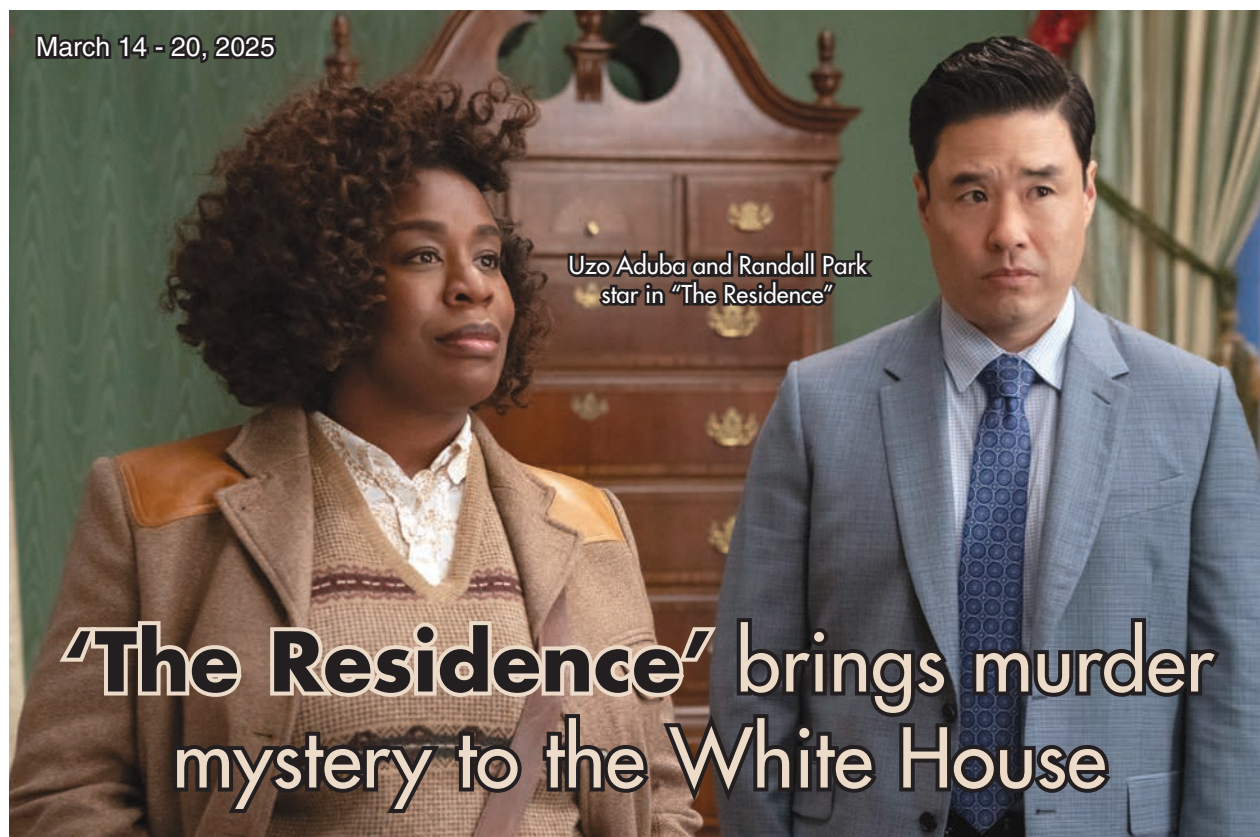
Uzo Aduba and Randall Park star in "The Residence"

'The Residence' brings murder mystery to the White House