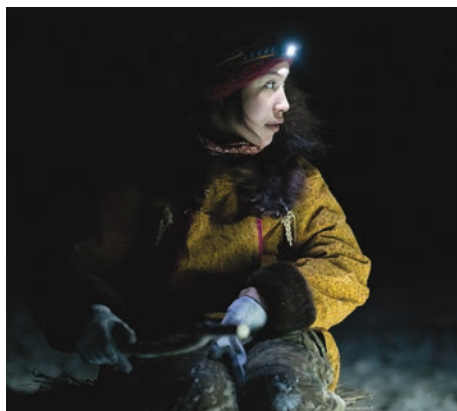
“Life Below Zero” - Season 23 (March 19)