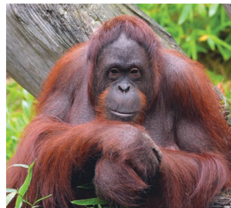
“Animals, They’re Just Like Us!” - Season 1 (March 22)

As winter tightens its grip, remote Alaskans battle the Arctic's brutal conditions. New faces and familiar ones must develop skills, confront inner demons, and endure until spring. These Alaskans carve out their legacies in unforgiving landscapes, proving that even in the harshest conditions, thriving is possible.