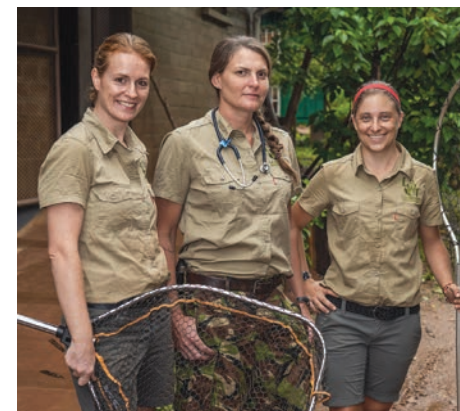
“Malawi Wildlife Rescue” - Season 2 (Available Now)

Peek inside the lives of penguins, giraffes, chimps, and other animals that behave a whole lot like humans. Touch down on all seven continents around the world to see why these wild creatures compete, co-operate, love, and grieve just like we do. From dolphins creating names to flamingos wearing makeup and monkeys that floss to sharks that visit the dentist, the animal kingdom is surprisingly similar to our own!