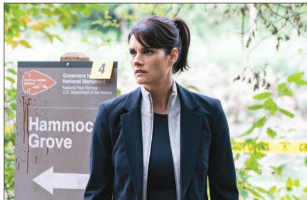
Missy Peregrin stars in "FBI"

FBI KDBC 7 p.m. Using their talents, intellect and technical expertise, Maggie (Missy Peregrin), OA (Zeeko Zaki) and the FBI's top agents do their best to keep New York City — and the United States as a whole — safe from terrorism, organized crime and counterintelligence.