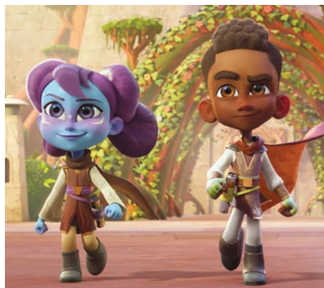
“Star Wars: Young Jedi Adventures” - Season 2, Part 2 (March 19)