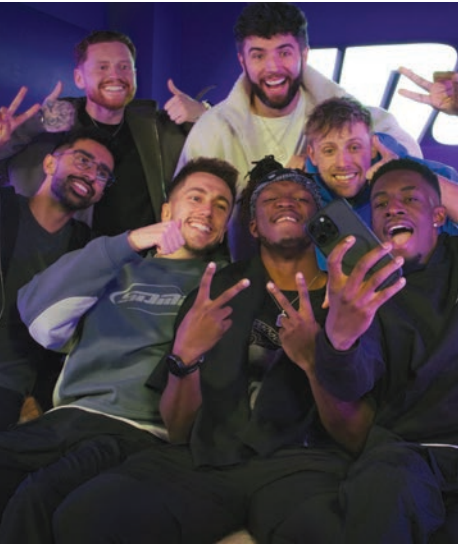
“Inside” - Season 2 (March 17) Content creators take on a series of challenges to win a huge cash prize in this reality series from viral British YouTubers, the Sidemen.