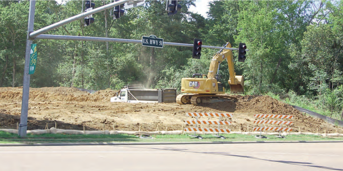
Construction crews work to extend Rice Road in Ridgeland as a new entrance to the City Center complex.