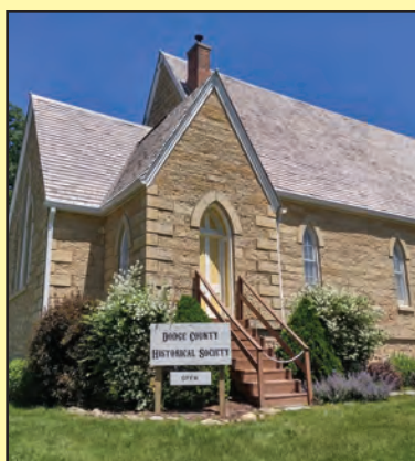
The Museum in Mantorville

One of our current projects at the Dodge County Historical Society is collecting history of the Claremont area.