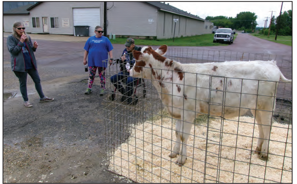
There were cows to touch, things for the kids and ice cream treats for all.