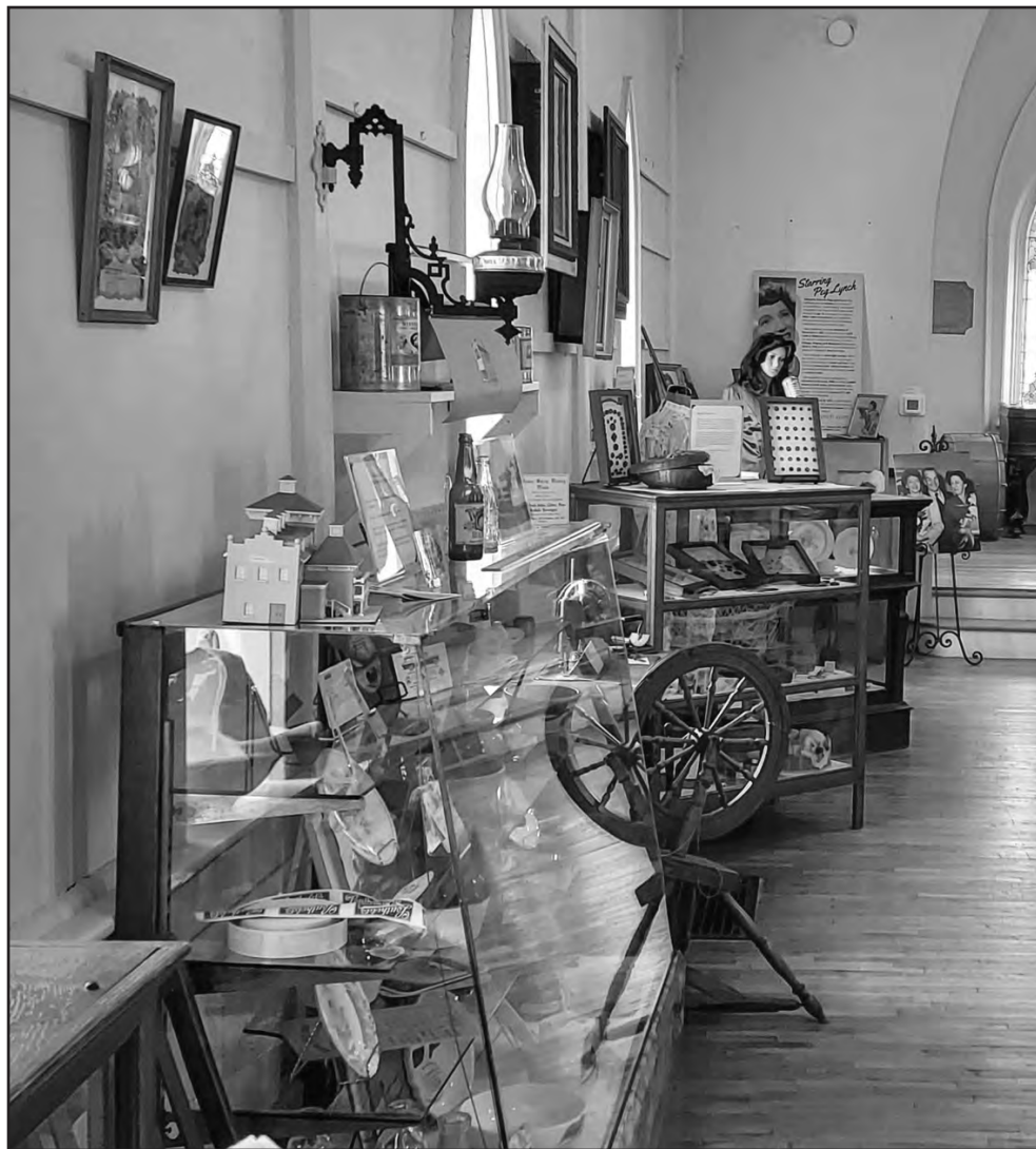
Several exhibits on the main floor of the Museum

As well as the regular open hours, we're happy to make appointments for guests at other times. Phone or email a day or two in advance, and we can arrange a time for your visit. Phone and leave a message at 507-635-5508 or email dodgecountyhistoricalsociety@gmail.com .