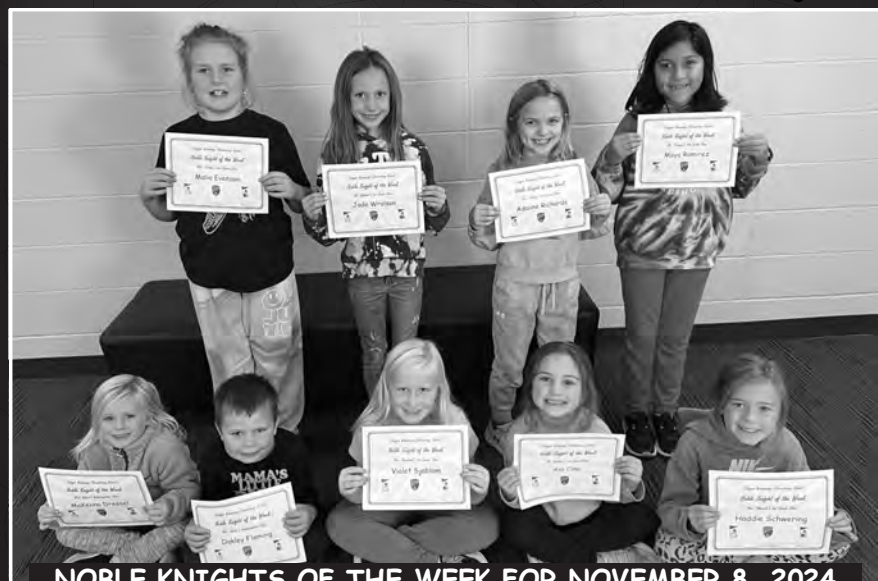
NOBLE KNIGHTS OF THE WEEK FOR NOVEMBER 8, 2024