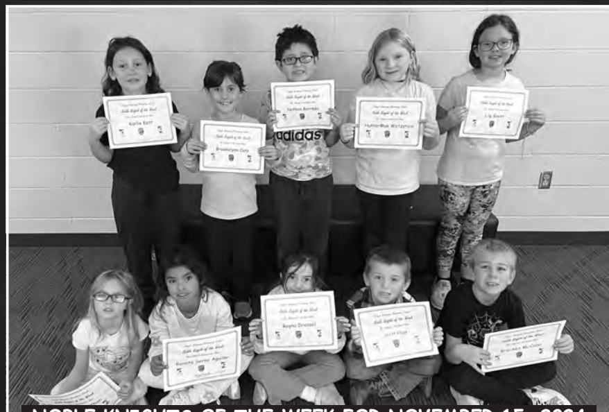
NOBLE KNIGHTS OF THE WEEK FOR NOVEMBER 15, 2024