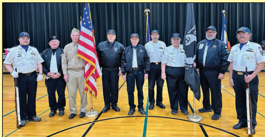
Members of the Wanamingo Veteran's Color Guard before a ceremony on November 11th at the K-W elementary school. The students planned a presentation honoring the local veterans. (additional picture on page 7)