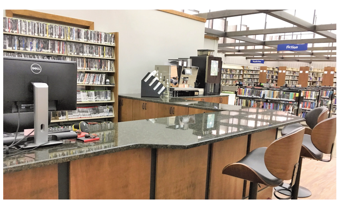
Philadelphia-Neshoba County Public Library ncing viding current and organized con- Go

The Philadelphia-Neshoba County Public Library seeks to improve the community through