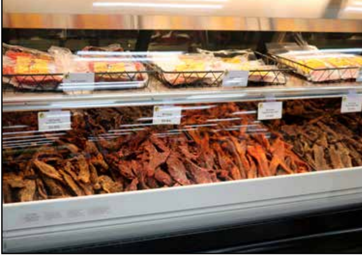
Buc-ee's, located at 200 World Commerce Parkway, boasts a large retail center, as well as numerous snack, meal and drink options.

Buc-ee's officially opened its first travel center in Florida at 6 a.m. Monday, Feb. 22 near World Golf Village. A ribbon-cutting ceremony conducted by the St. Johns County Chamber of Commerce was held at 11 a.m.