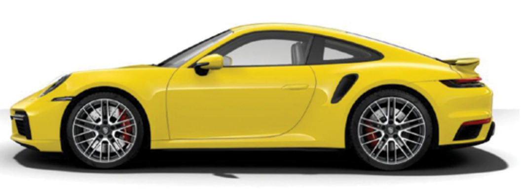
2021 Porsche 911 Turbo in Racing Yellow