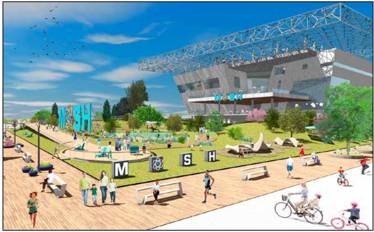
A preliminary rendering (for illustration purposes only) shows an example of what the new MOSH facility could possibly look like.

The cultural ecosystem will explore Northeast Florida, its roots and its future identity. Art, music, dance and