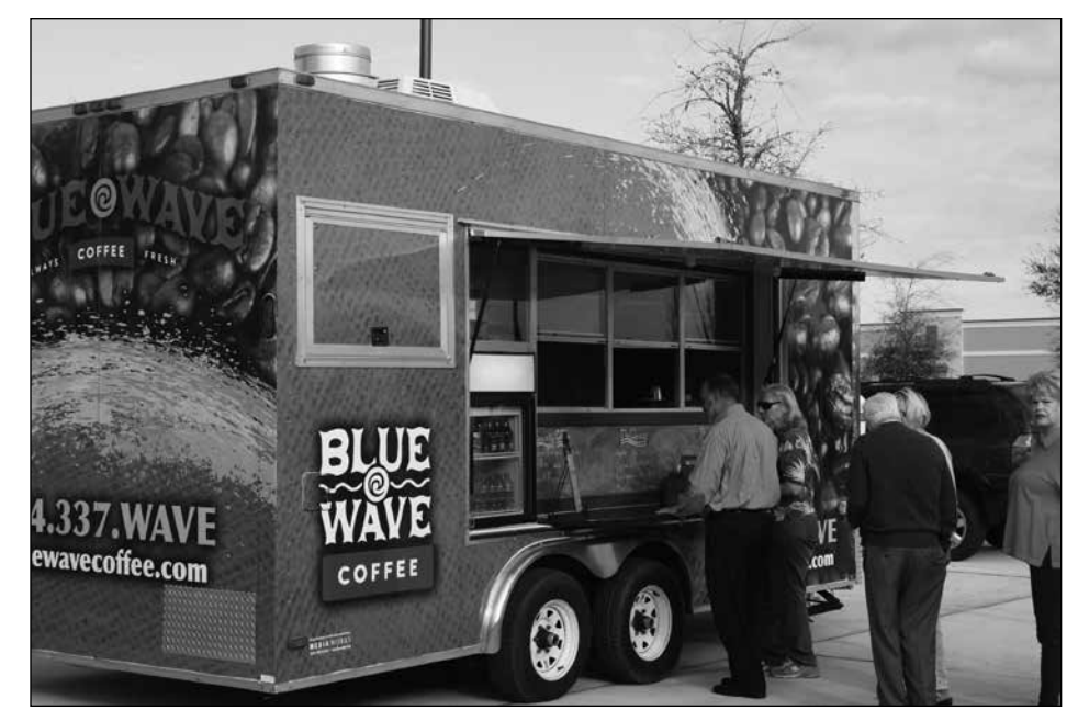
Blue Wave Coffee truck