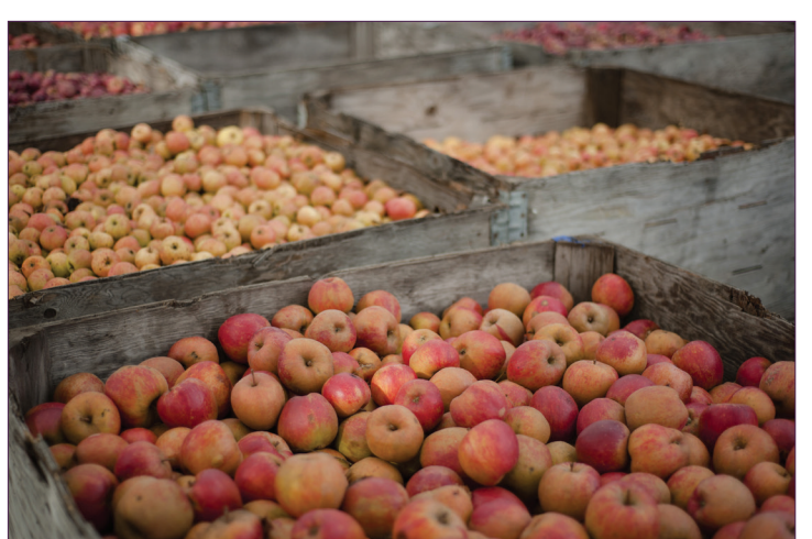
Organic orchard apples from Finnriver.

On Saturday afternoon the party revs up back at the Palindrome with the Cider Saloon, featuring more than 40 regional ciders, apple pressing and live music. Tickets include 10 hard cider tastings and a festival shot glass. From 6-9 p.m., the Fireside Restaurant in Port Ludlow will serve a multi-course Family Style meal with Sommelier-selected pairings from local craft cideries, this menu will feature locally sourced cheeses with apple confiture, buttercup squash bisque with roasted apple curry, applewood smoked bacon braised brussels sprouts with Nash's pork loin, and a baked caramel apple to finish. The official weekend after-party lights