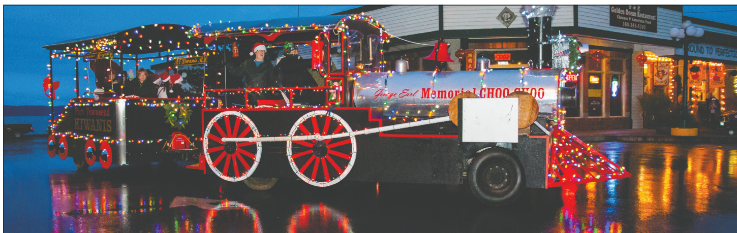
Hitch a ride aboard the Kiwanis Choo Choo Train in Port Townsend this holiday season!

As the twinkling glow of Christmas lights illuminate the North Olympic Peninsula amid these ever-shortening days of winter, the busy holiday season is in full swing across Port Townsend and beyond. From roaming carolers, holiday arts and crafts fairs, and gingerbread contests to an abundance of gift-buying options that support small business, year's end in Jefferson County abounds with festive opportunities to enjoy, support, and be a part of our community.