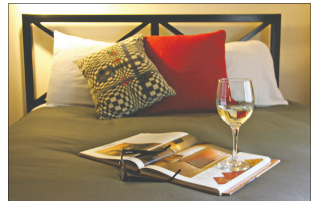
With personalized guest packages available, The Washington Hotel is an accommodation destination for those seeking an added touch of romance.

Sullivan's husband, Patrick, is also a wedding officiate available to perform marriage ceremonies for hotel guests should the need arise.