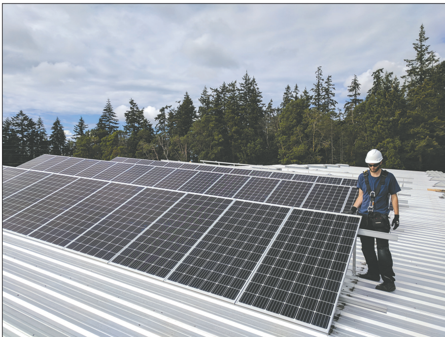
Cascadia Solar recently installed 270 solar modular panels on the roof of Edensaw Woods’s largest warehouse at its Port Townsend facility.