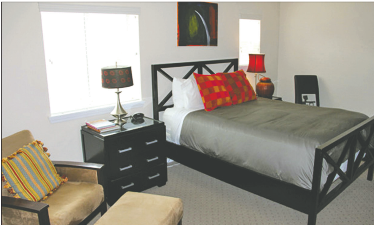
Old-time charm meets modern style in all four of The Washington Hotel's second-story suites.