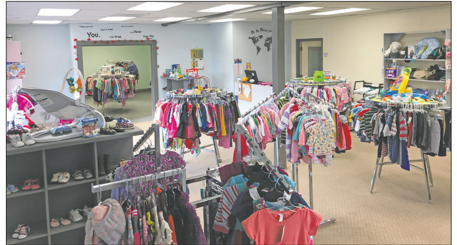
Hey Baby is a children's clothing consignment store offering gently used and high-end clothing as well as books and maternity clothing.