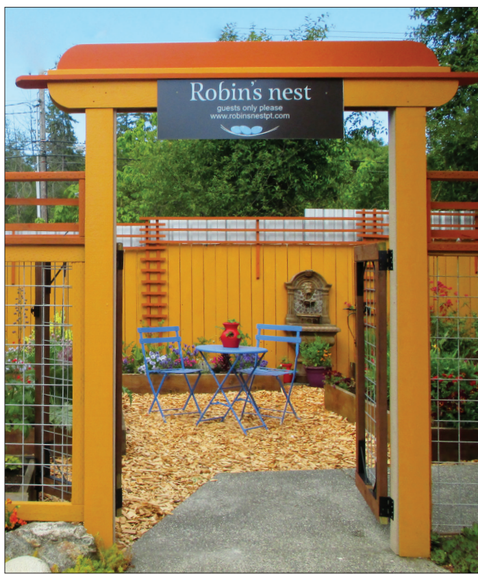
The courtyard and garden at Robin's Nest.

1190 21st St., Port Townsend www.RobinsnestPT.com 208-390-5327