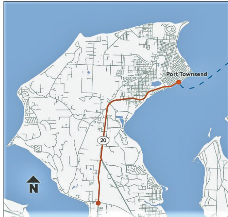
The six mile paving project will extend from Four Corners to the Ferry Terminal.

A grand opening for Howell's Sandwich Co. Support a local Young Professional's new business while enjoying a great sandwich from the water view on the deck. Find them between Lively Olive and The Spice and Tea Exchange at 929 Water St, in PT. Or call (360) 344-8484 or visit them at www.howellssandwichco.com.