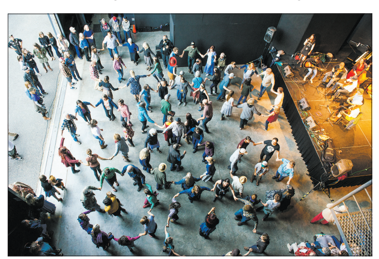
Nothing says summer in Port Townsend like a concert at the McCurdy Pavilion and dancing the night away.