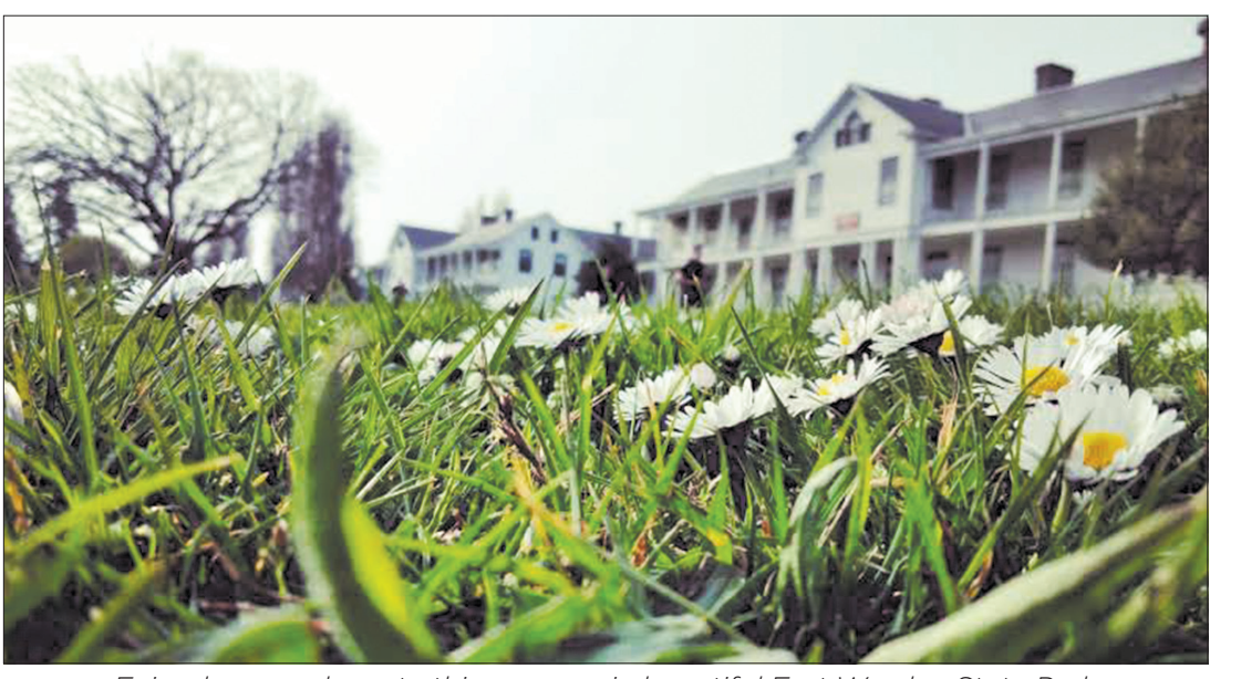
Enjoy, learn and create this summer in beautiful Fort Worden State Park.

and best-selling author of 16 books, winning numerous awards for his poetry, fiction and essays. Born in Tijuana to a