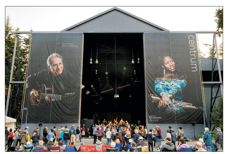
Arrive early and buy lunch on the green before afternoon Pavilion concerts!