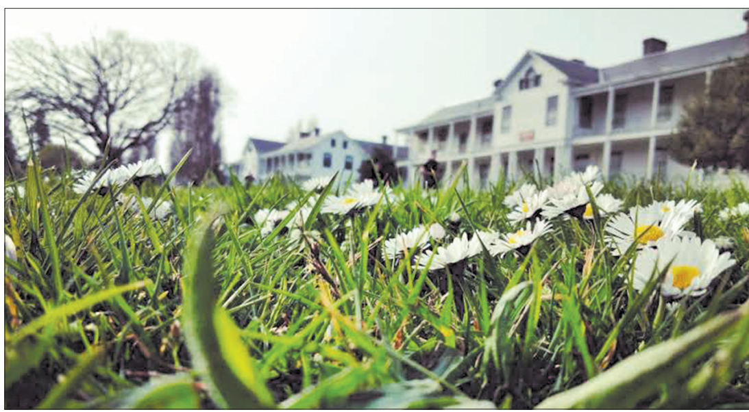
Enjoy, learn and create this summer in beautiful Fort Worden State Park.

Centrum Foundation is a 501 (c)(3) nonprofit organization, tax identification #23-7348302; TD Ameritrade, DTC # 0188, Account # 868-102-644. Donations are tax deductible as allowable by law.