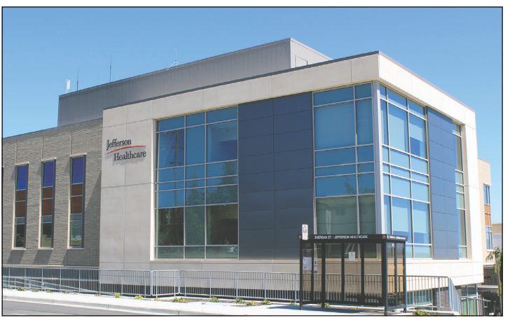
Jefferson Healthcare as viewed from Sheridan Street in Port Townsend.

Jefferson Healthcare's Revised Prices for Improved Transparency