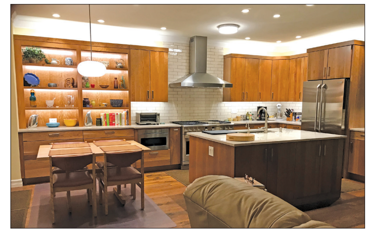
Contractor RH Mittet specializes in remodeling and tenant improvements for residential and commercial buildings, with recent projects including this complete kitchen remodel.